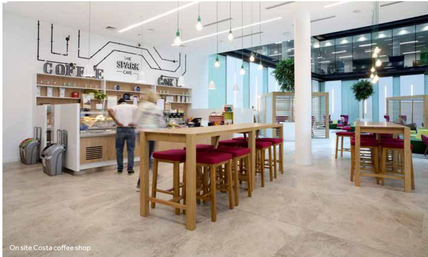
On site Costa coffee shop