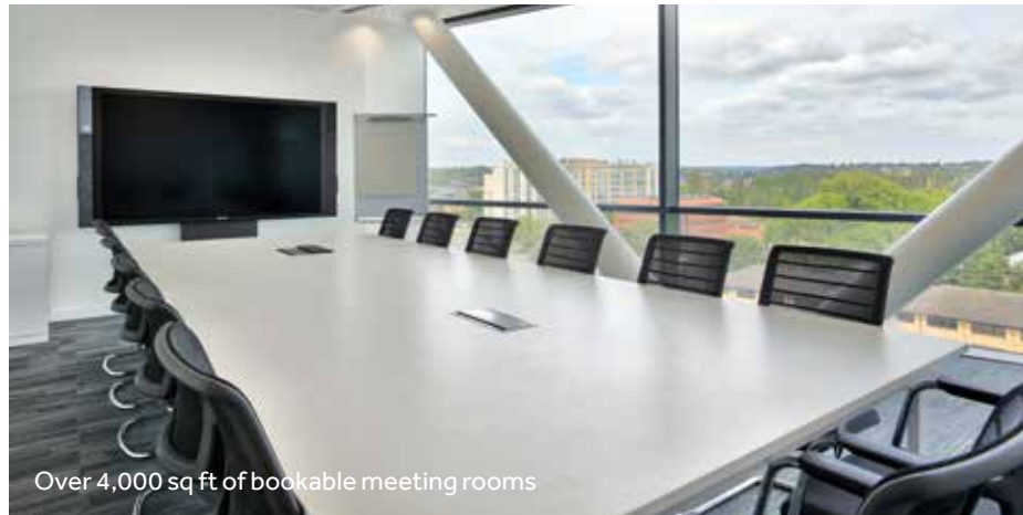
Over 4,000 sq ft of bookable meeting rooms