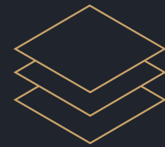
Metal Tiled Suspended Ceiling