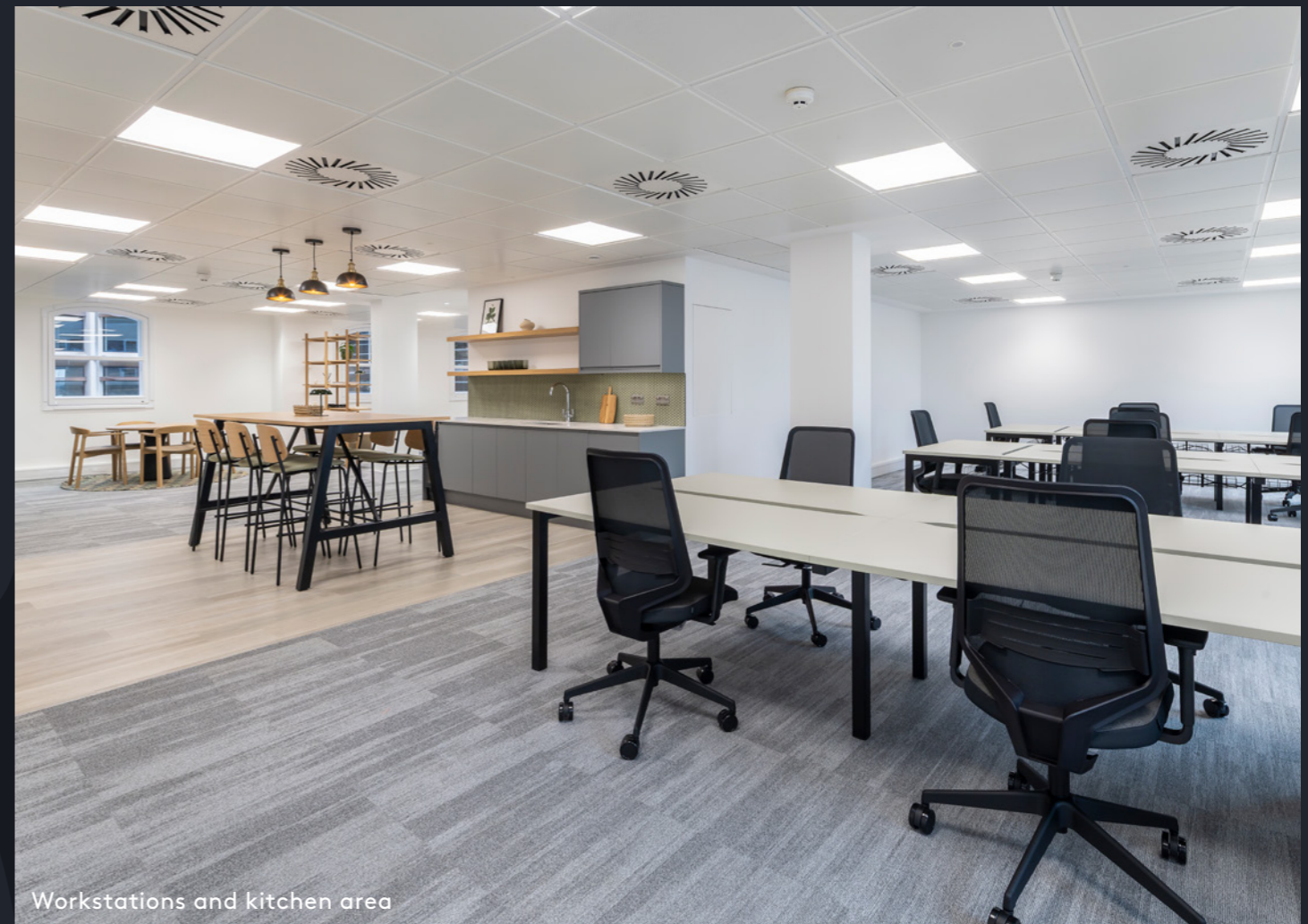
Workstations and kitchen area

The 4th floor, the largest in the building offers premium workspace, including open-plan workstations, partitioned meeting rooms, a client waiting lounge, breakout and collaboration areas, as well as a modern kitchen and dining space.