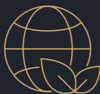
EPC Rating - B