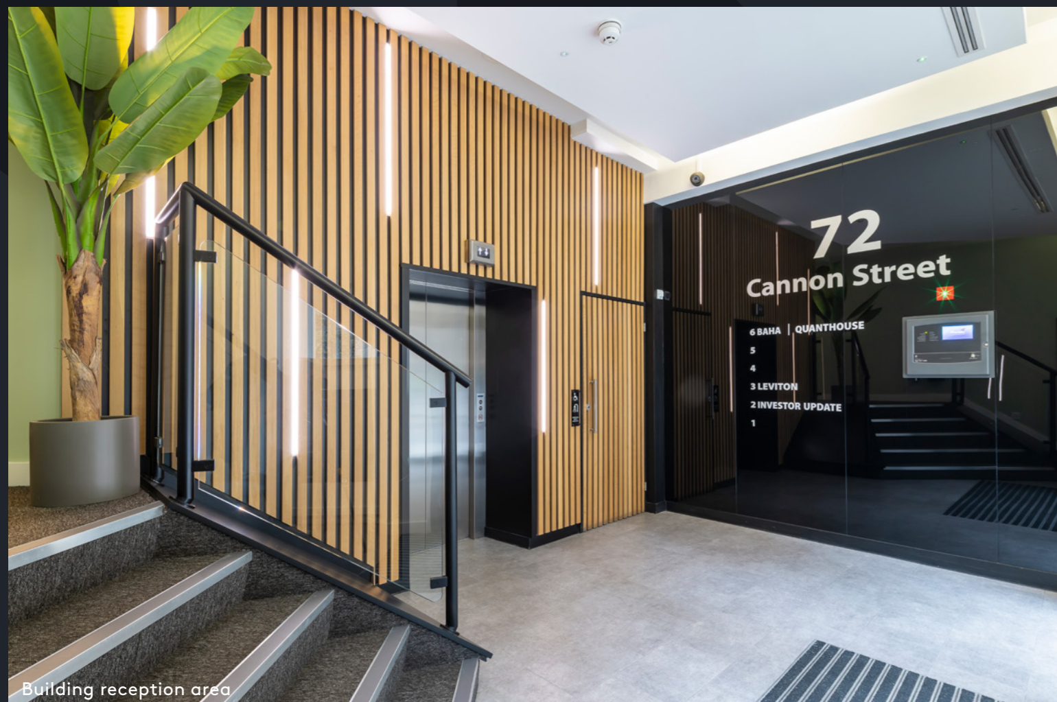
Building reception area