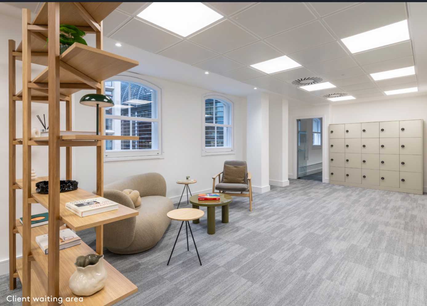
Client waiting area