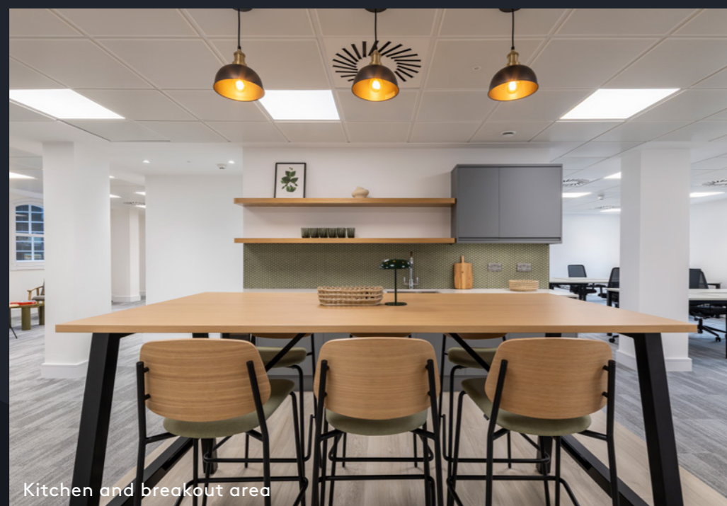
Kitchen and breakout area