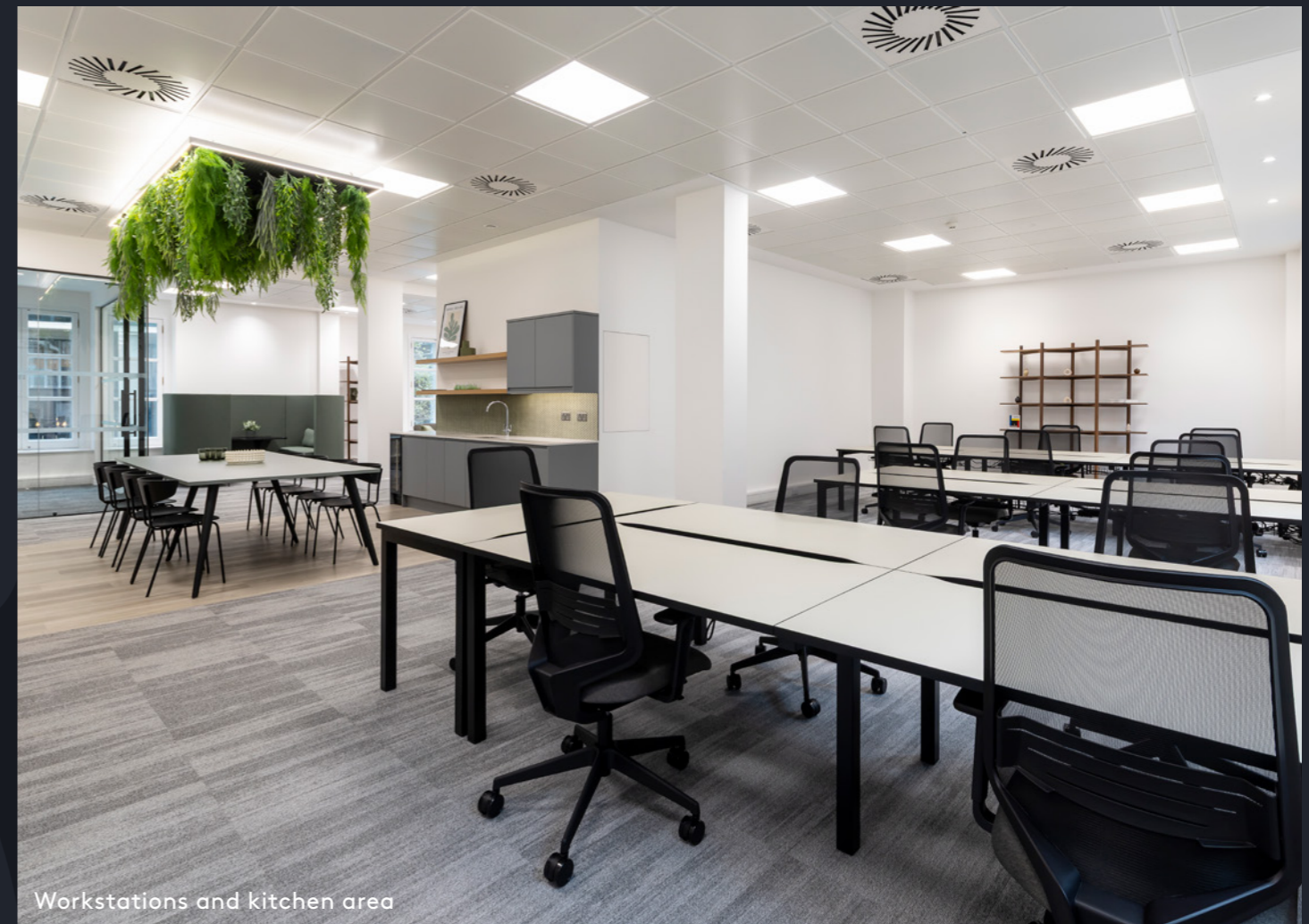
Workstations and kitchen area