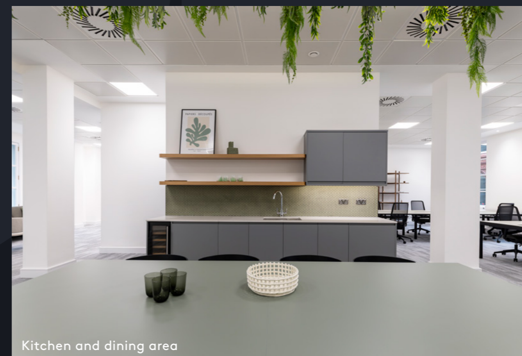
Kitchen and dining area