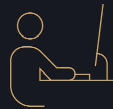
Newly Refurbished Workspace