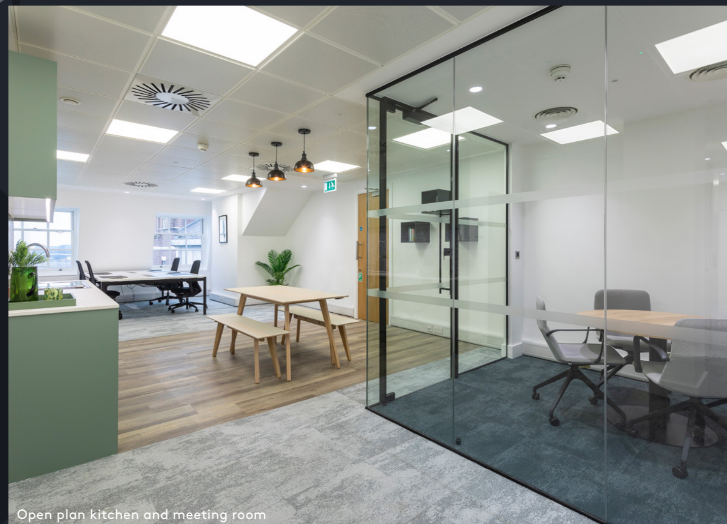
Open plan kitchen and meeting room