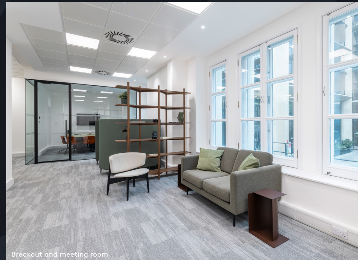
Breakout and meeting room