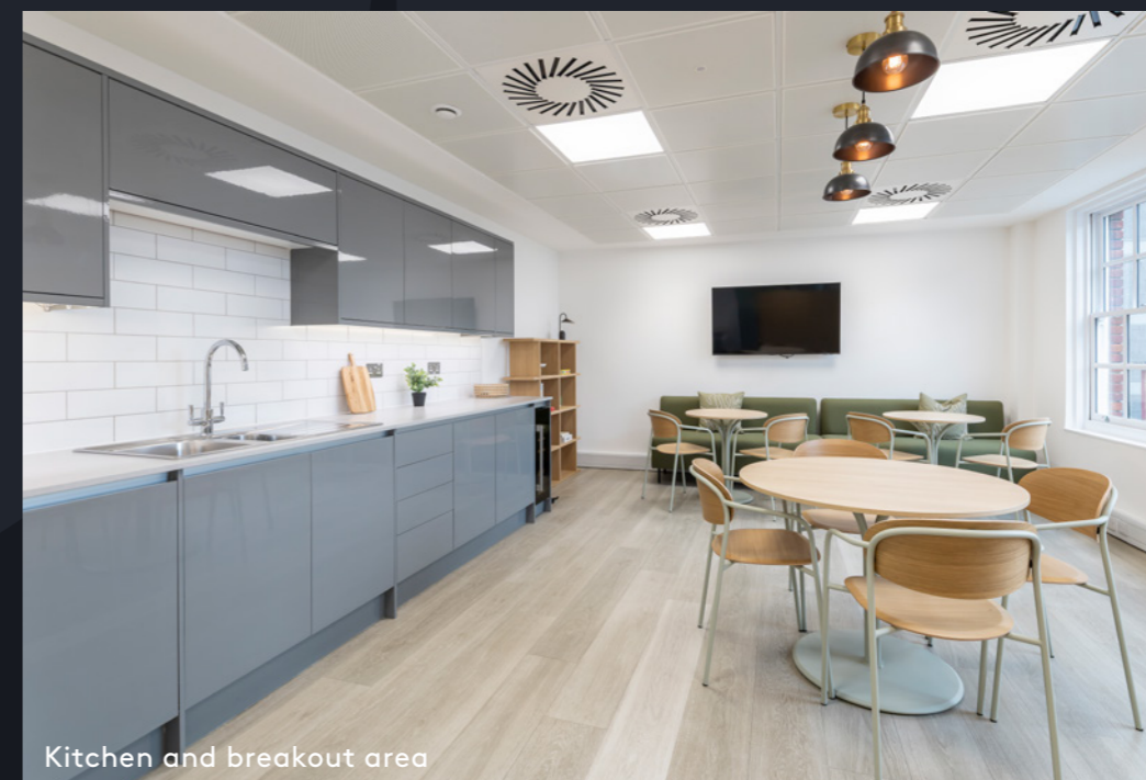
Kitchen and breakout area