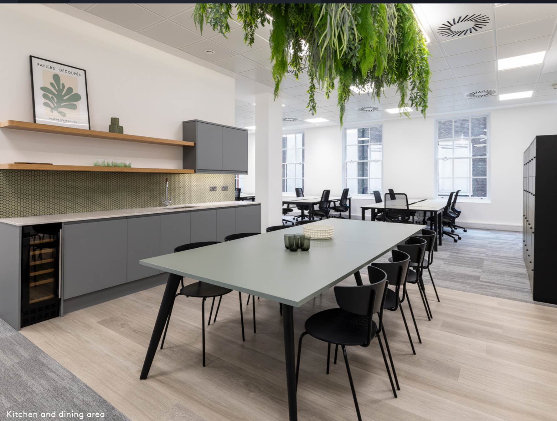
Kitchen and dining area