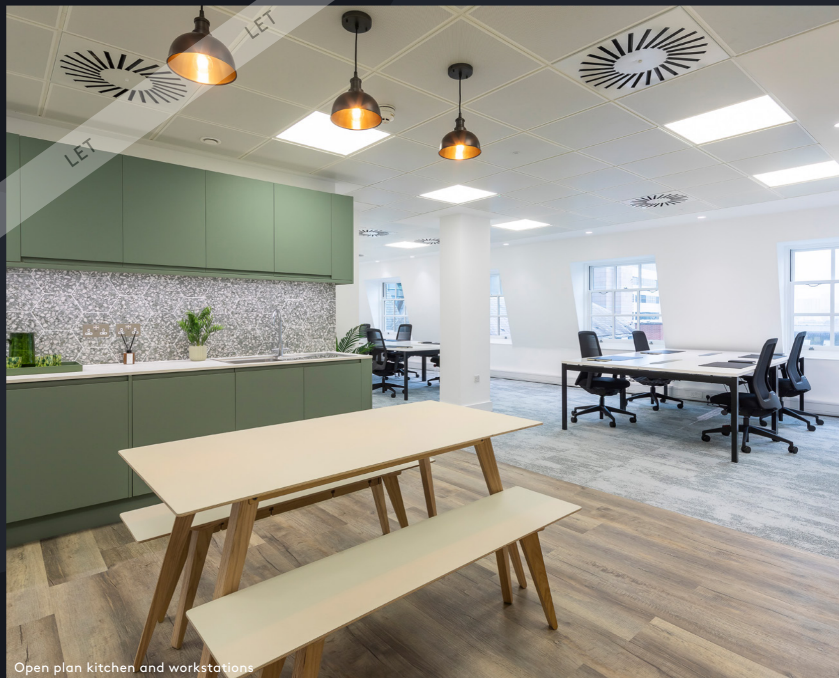
Open plan kitchen and workstations