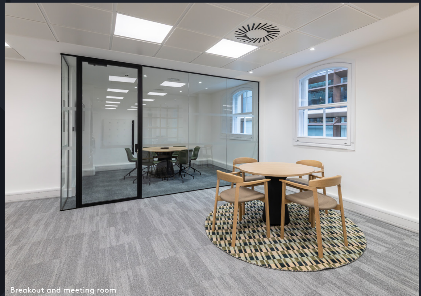
Breakout and meeting room