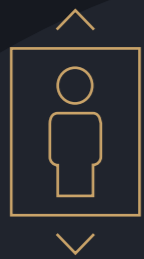
8 Person Passenger Lift