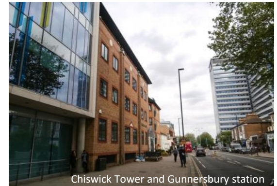
Chiswick Tower and Gunnersbury station

TO LET Recently refurbished offices 1,500 – 8,503 sq ft