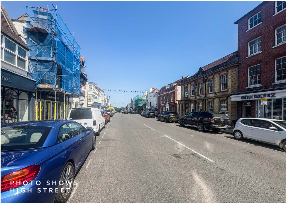
PHOTO SHOWS HIGH STREET