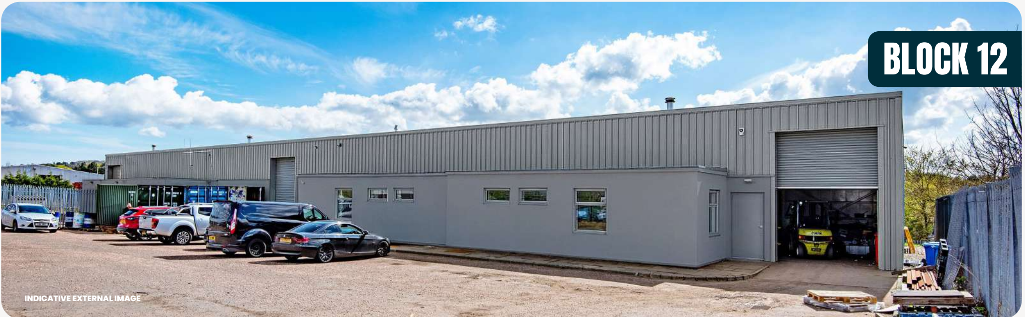
INDICATIVE EXTERNAL IMAGE