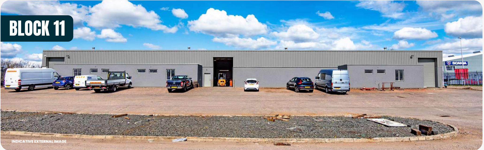
INDICATIVE EXTERNAL IMAGE