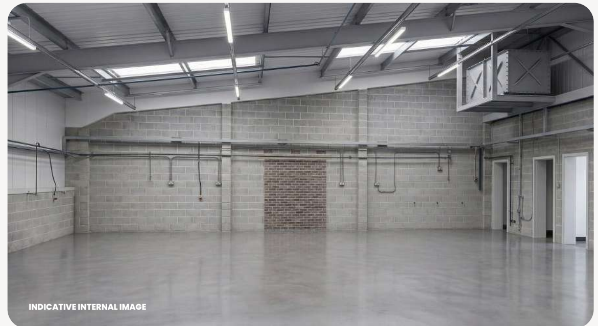
INDICATIVE INTERNAL IMAGE