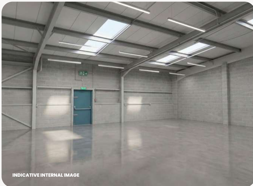
INDICATIVE INTERNAL IMAGE