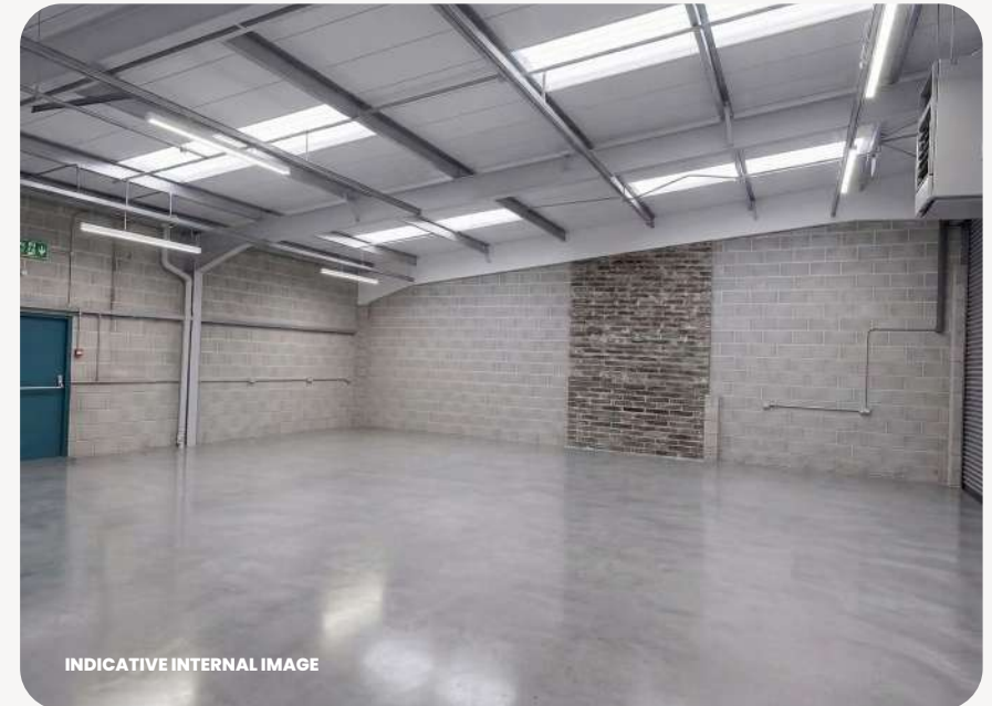
INDICATIVE INTERNAL IMAGE