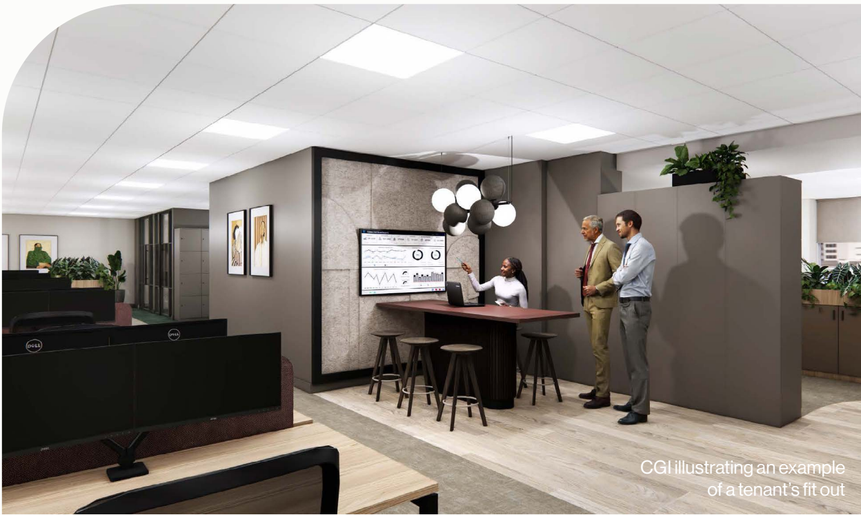
CGI illustrating an example of a tenant's fit out