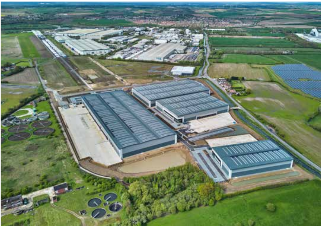
Sherburn 42 Sherburn-in-Elmet, Leeds 4 prime industrial / distribution units from 57,750 – 280,000 sq ft