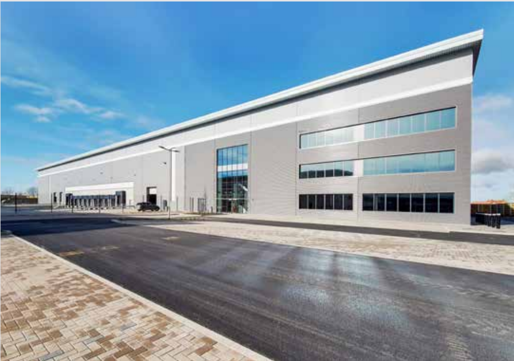
Ascent Logistics Park Leighton Buzzard Eight warehouse / industrial units 14,140 to 123,490 sq ft

Firethorn deliver strategically located logistics spaces across the UK to enable businesses to connect quickly and easily with customers and end users. As we invest, develop and deliver, we remain true to our core values of being progressive in our thinking, decisive in our actions and committed to high standards, leveraging our expertise to maximise potential.