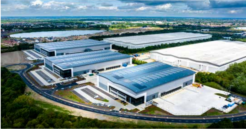
Peterborough South Peterborough Three warehouse / logistics units 94,225 to 240,830 sq ft