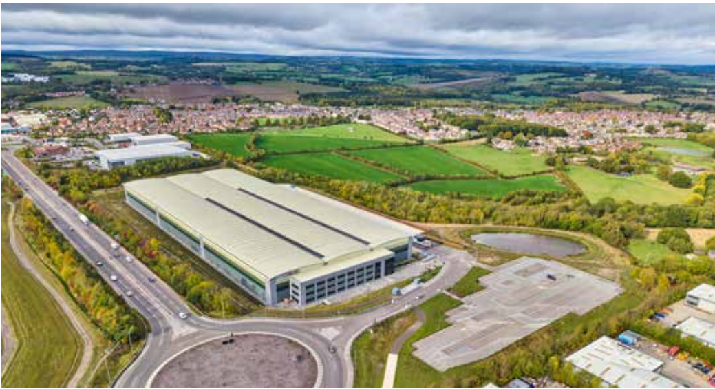
Barnsley 340 340,000 sq ft Grade-A logistics unit