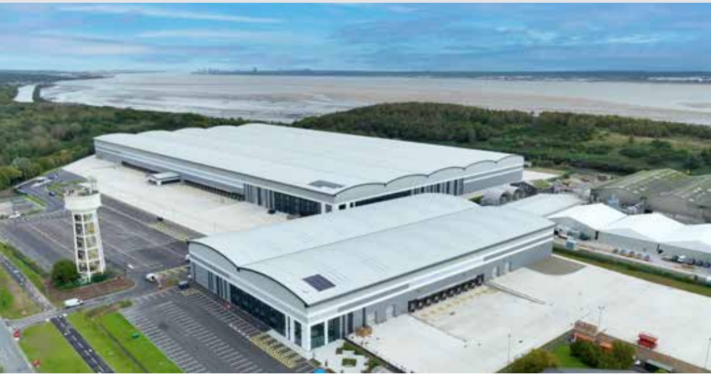
Link Logistics Park Ellesmere Port Two warehouse / logistics units of 654,225 sq ft and 107,506 sq ft