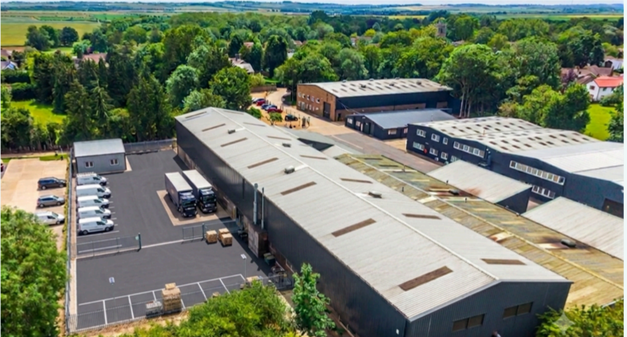
CGI of extra rear yard to Unit 4.