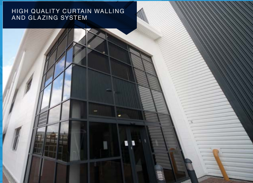
HIGH QUALITY CURTAIN WALLING AND GLAZING SYSTEM

STEEL WORK PRE-FINISHED WITH FACTORY APPLIED TWO PART EPOXY COATING