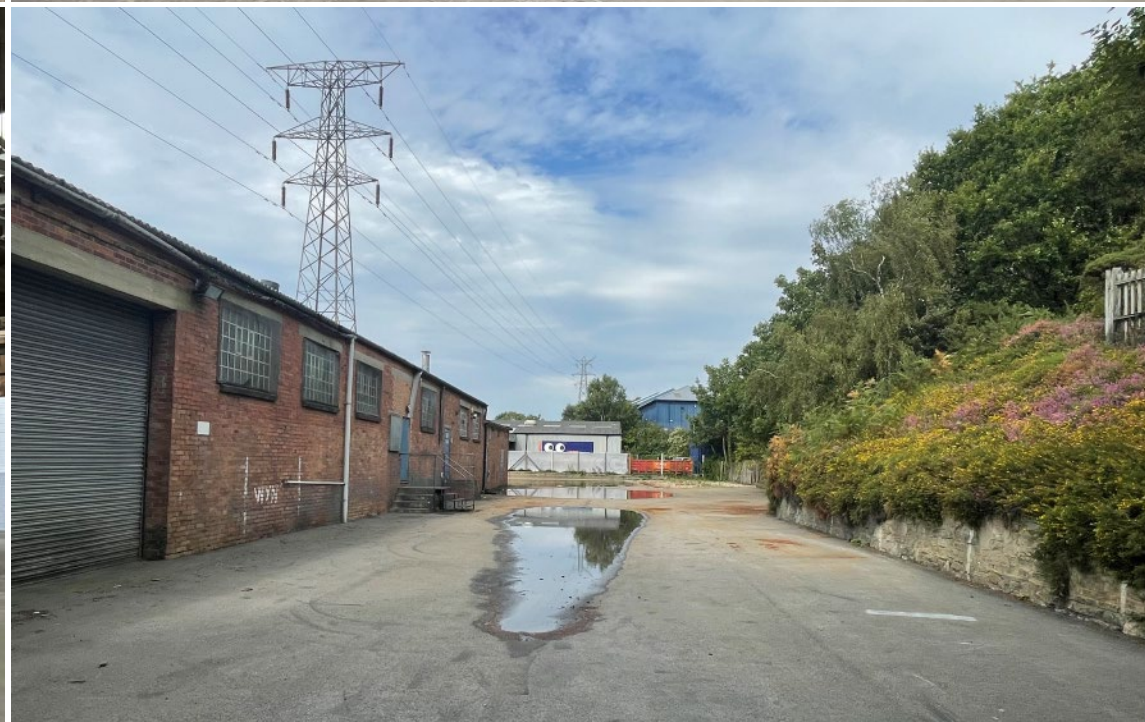
UNITS A, B & C | SHARP ROAD | POOLE | DORSET | BH12 4BG