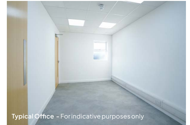
Typical Office - For indicative purposes only