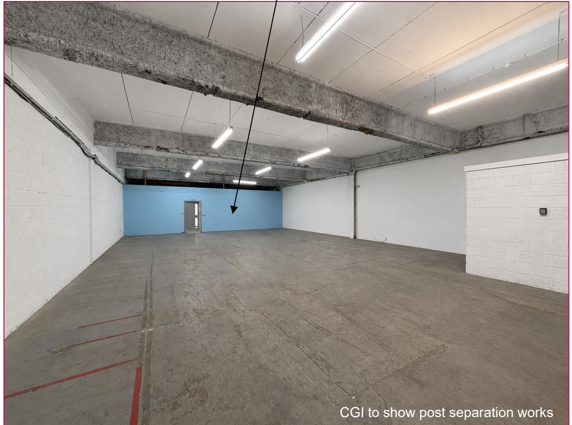
CGI to show post separation works