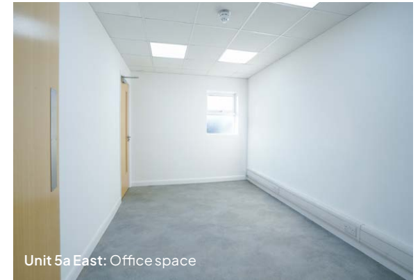
Unit 5a East: Office space