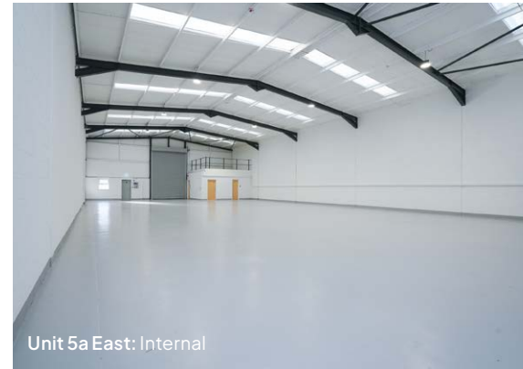
Unit 5a East: Internal