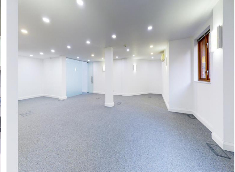
UNIT 1a ground floor