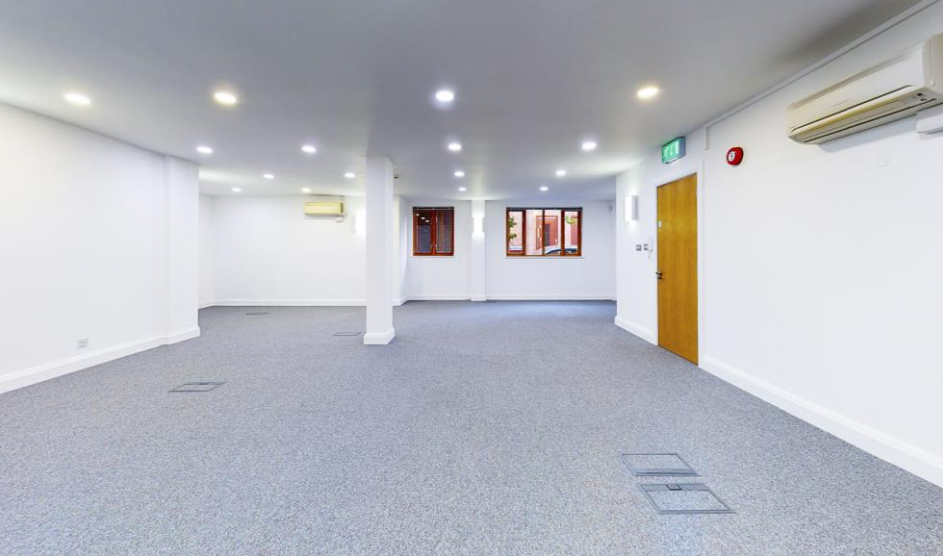
UNIT 1a ground floor