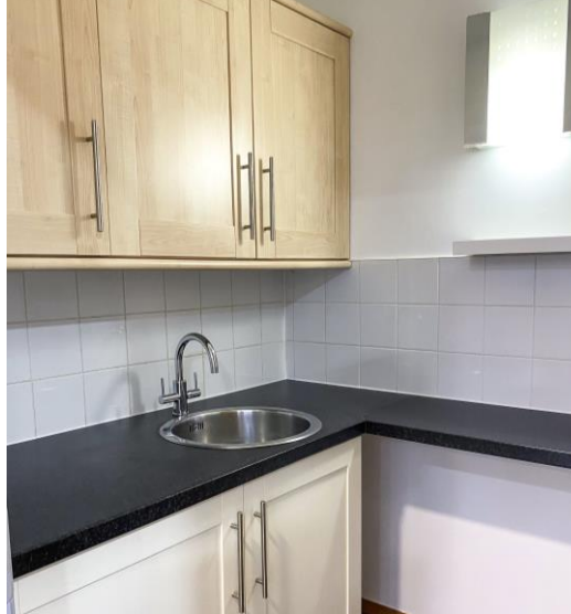
UNIT 1a ground floor