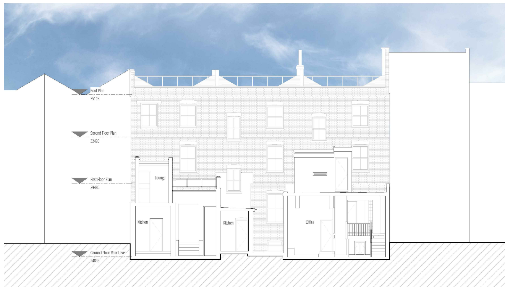
1 Existing Section AA' 1:100

NOTES: 1. THIS DRAWING IS COPYRIGHT AND MUST NOT BE REPRODUCED IN WHOLE OR IN PART WITHOUT WRITTEN PERMISSION OF GAA DESIGN. 2. THIS DRAWING REPRESENTS DESIGN INTENT AND CONCEPT ONLY. HENCE IT CAN BE SCALED FOR PLANNING PURPOSES ONLY. 3. THIS DOCUMENT AND ALL ASSOCIATED DOCUMENTS ARE PREPARED FOR SPECIFIC SITE AND SCHEME AND INCORPORATE CALCULATIONS AND MEASUREMENTS AVAILABLE FROM THE CLIENT AT THE TIME OF DRAFTING. 4. THE RECIPIENT AGREES TO PROTECT THE CONTENTS FROM DISSEMINATION AND DISSEMINATION EXCEPT AS REQUIRED FOR THE SPECIFIC CLIENT NAMED, WITHOUT THE WRITTEN PERMISSION OF THE DESIGNER. 5. USE OF THIS DESIGN IS GRANTED TO THE CLIENT FOR THE SPECIFIC AND NAMED EVENT ONLY. COPYRIGHT © 2019