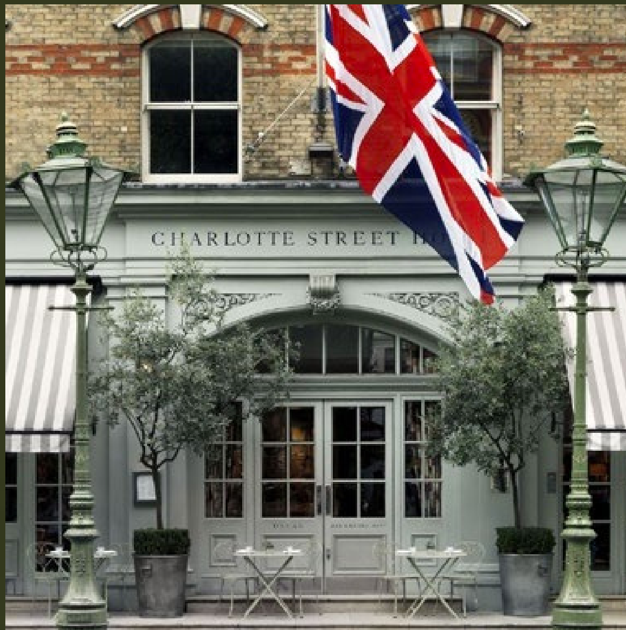
Charlotte Street Hotel