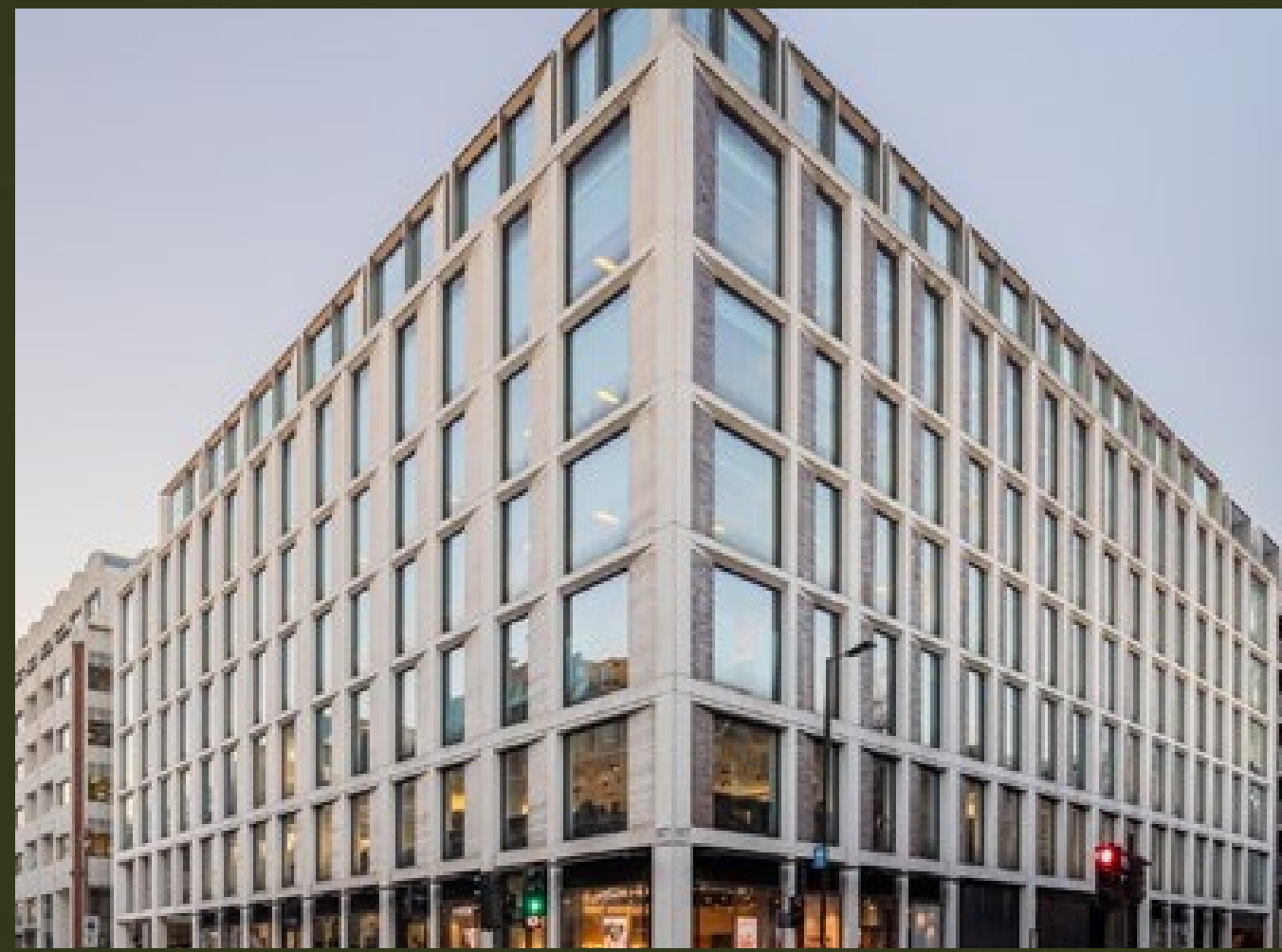
Estée Lauder HQ