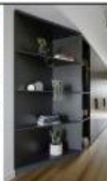
End shelf to kitchen