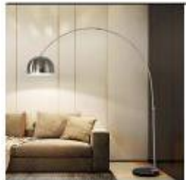
Feature entrance lamp