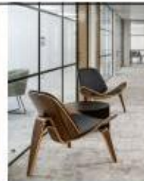
Feature chairs (from previous job)