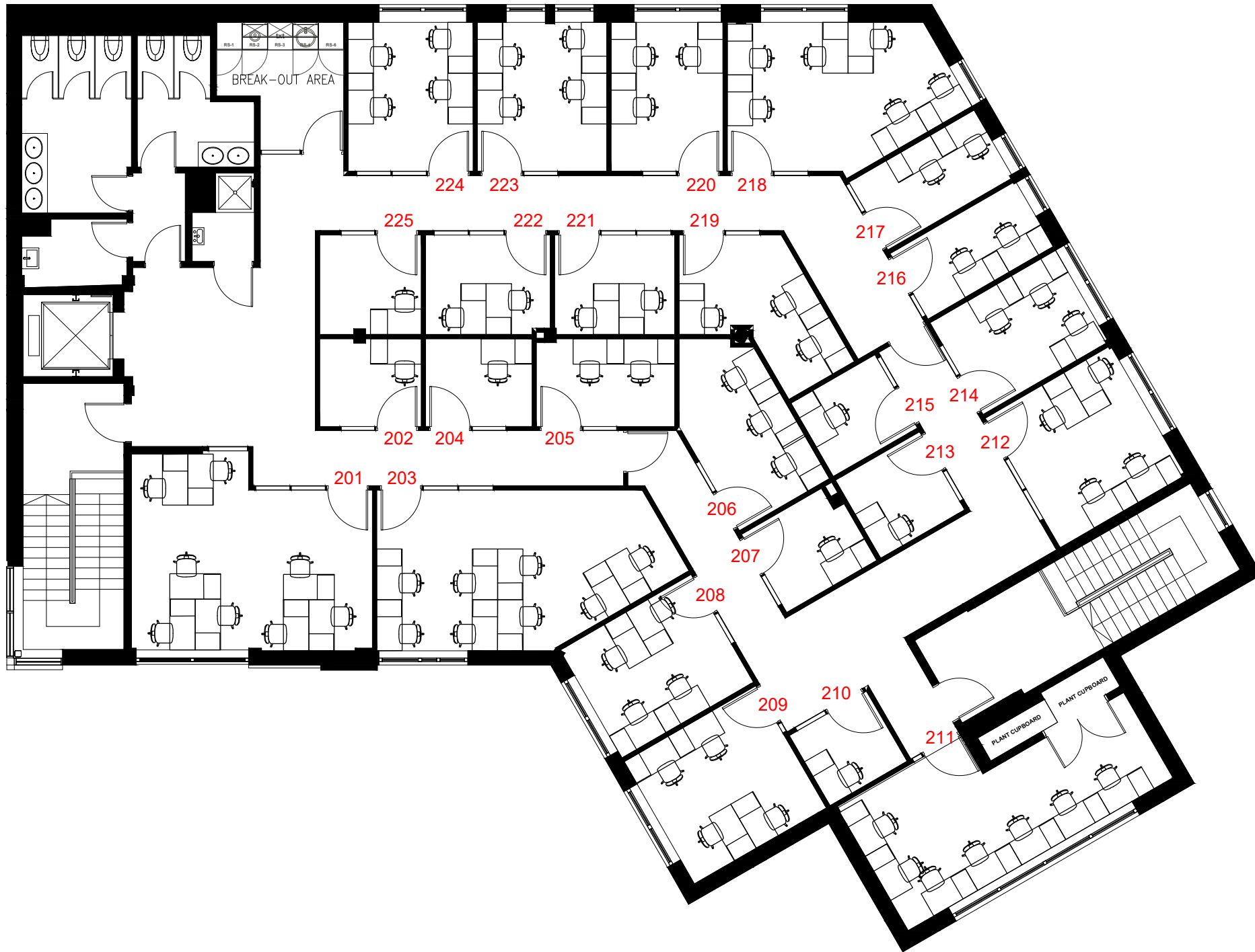
2ND LEVEL FLOOR PLAN