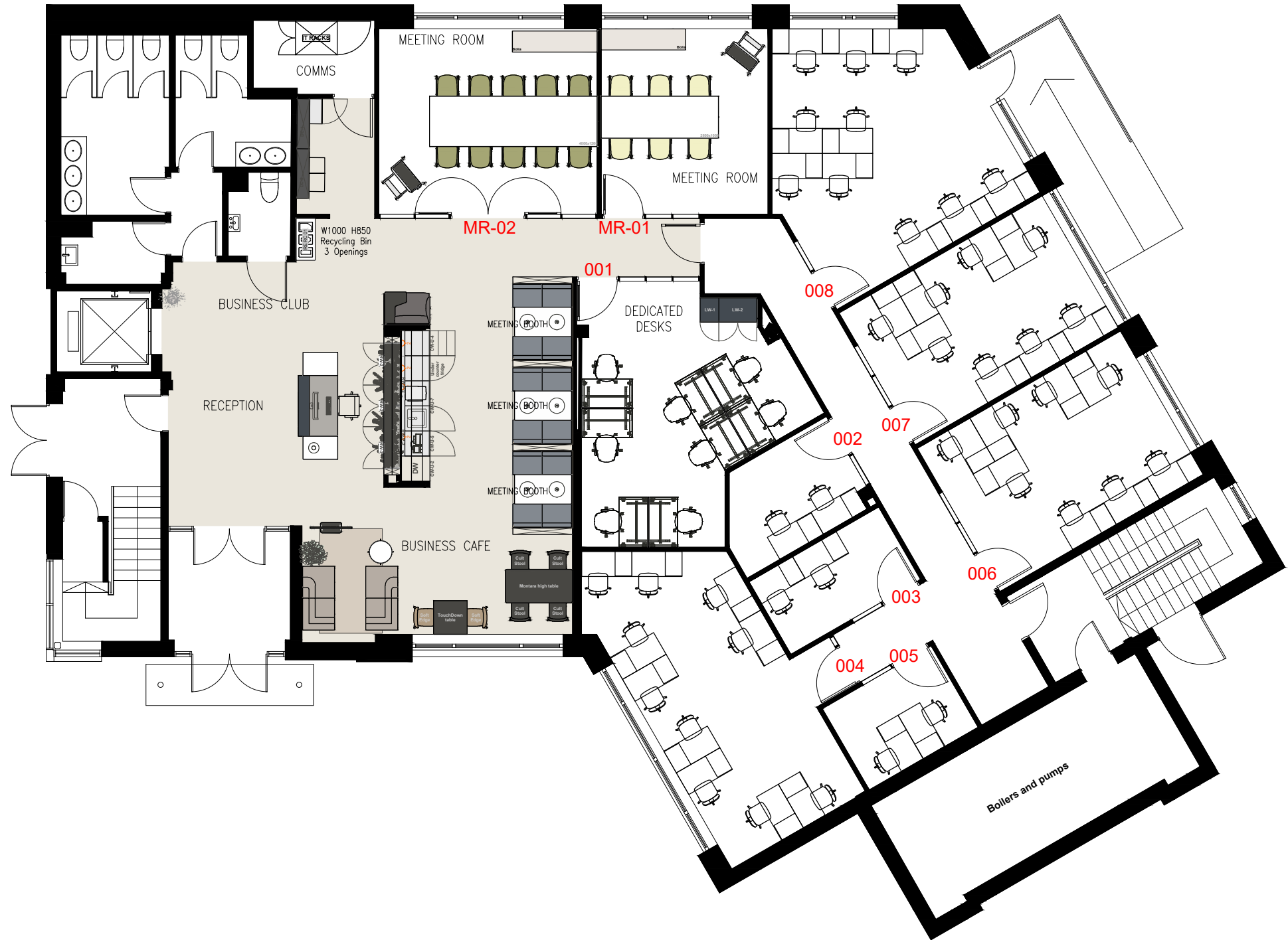
GROUND LEVEL FLOOR PLAN