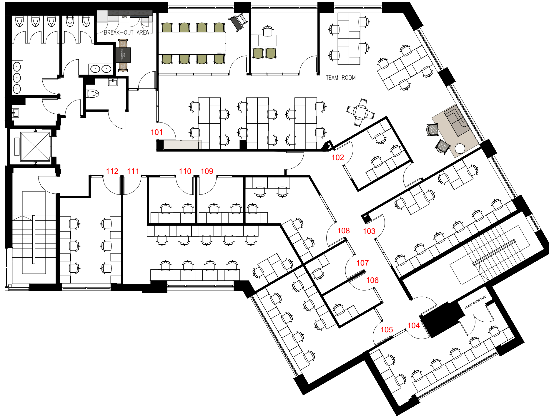
1ST LEVEL FLOOR PLAN