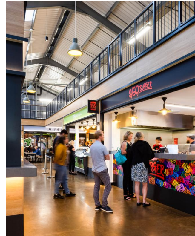
Whitehill & Bordon Regeneration – new supermarket, homes & The Shed retail & leisure development