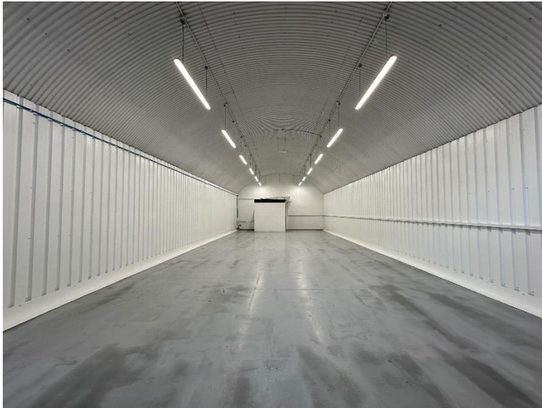
1 : Indicative Lined Arch

Viewings - strictly by appointment through Grant Mills Wood:-