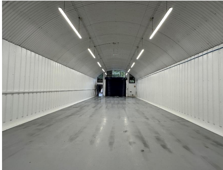
2 : Indicative Lined Arch