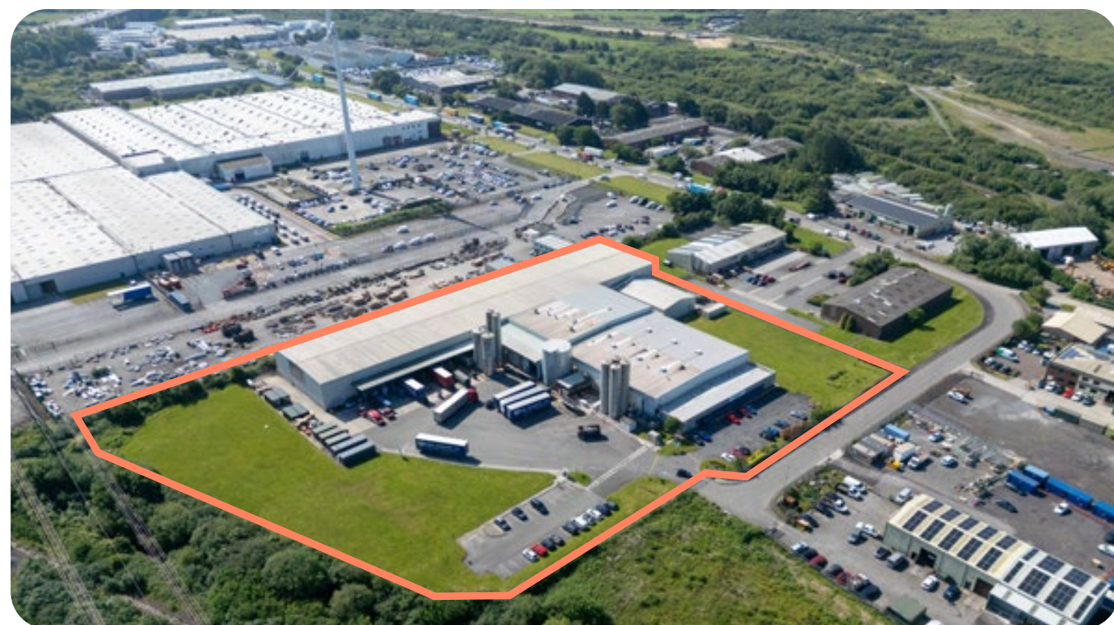
Unit 35 Kenfig Industrial Estate