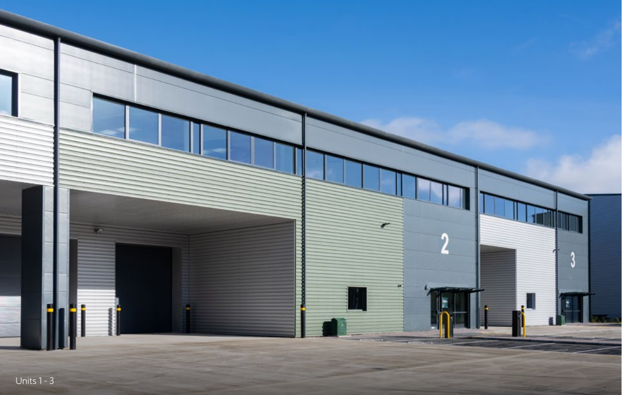
Units 1 - 3