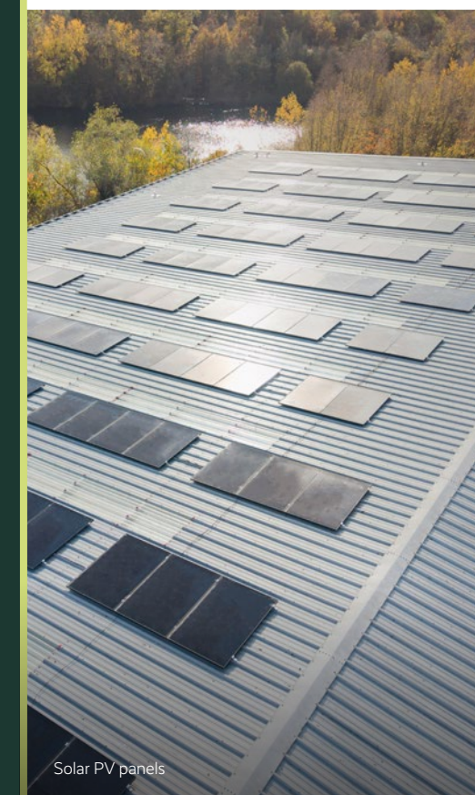
Solar PV panels