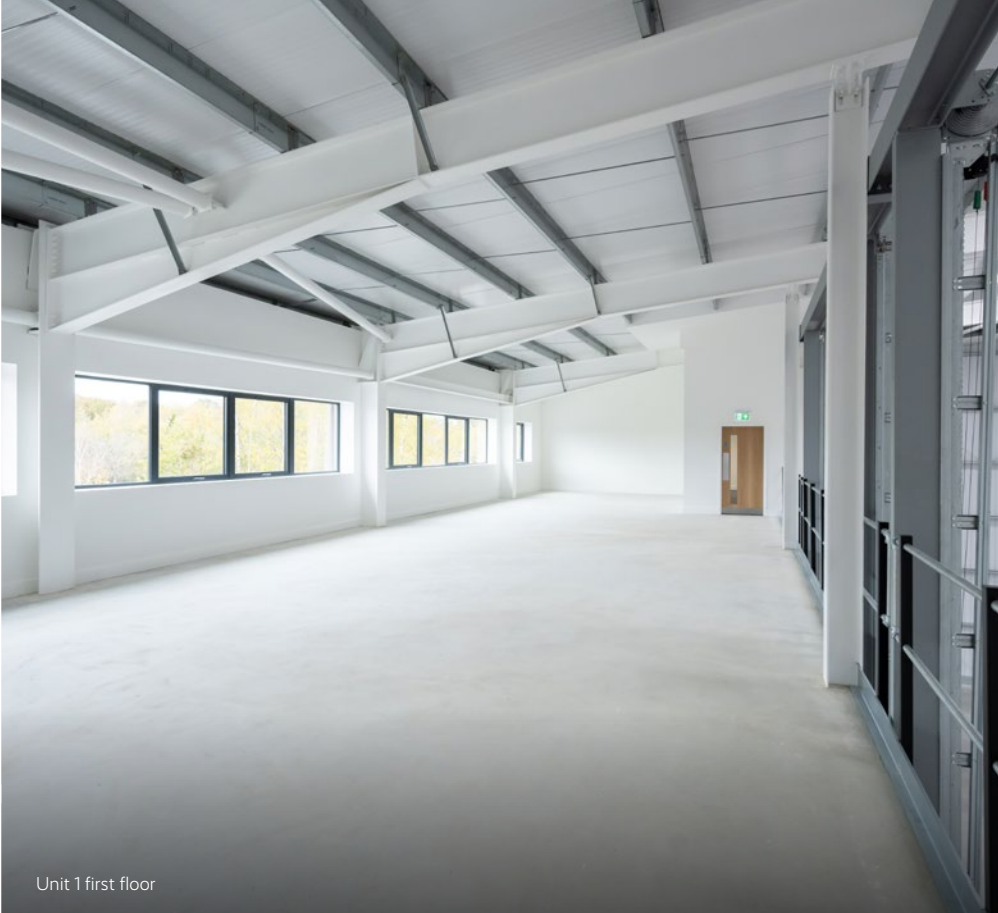
Unit 1 first floor