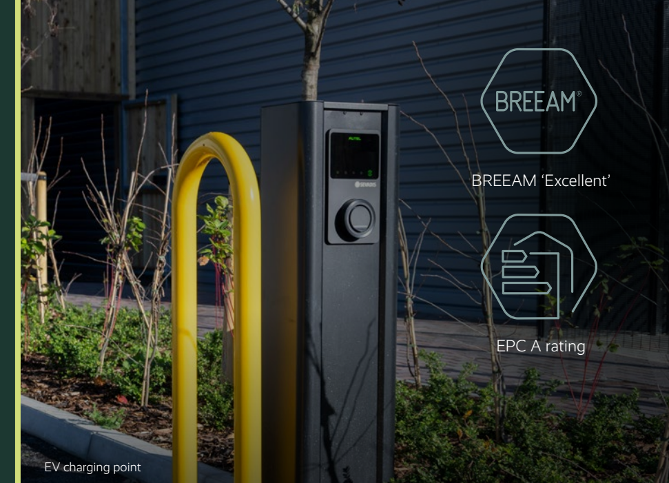
EV charging point

*Potential savings of up to £0.54 per sq ft per annum through use of PVs based on using current energy prices as of January 2025 and assuming 100% PV generation is used.