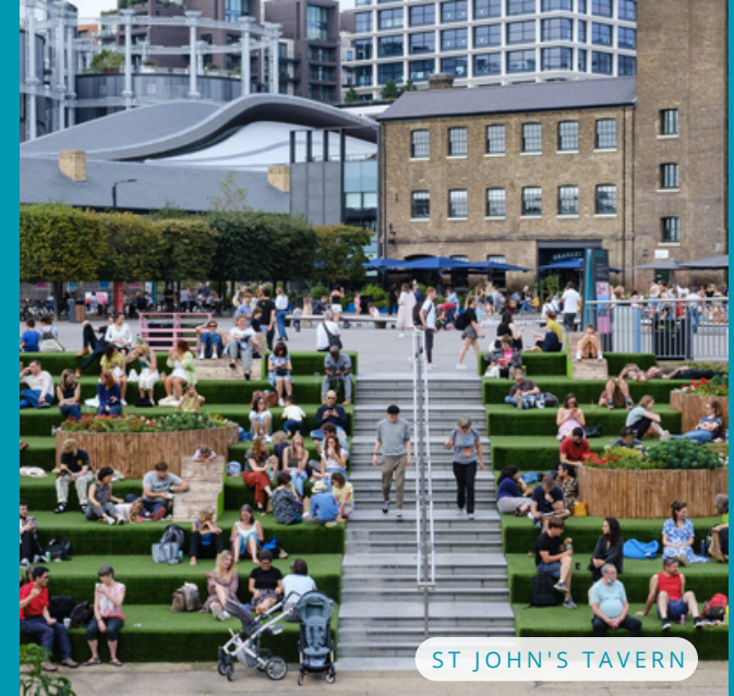
ST JOHN'S TAVERN