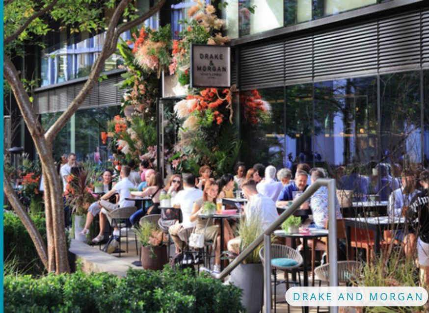
DRAKE AND MORGAN