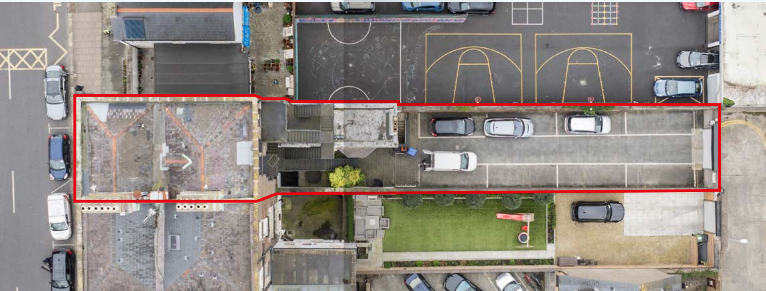
The outline of the property is shown for indicative purposes only on a non reliance basis.