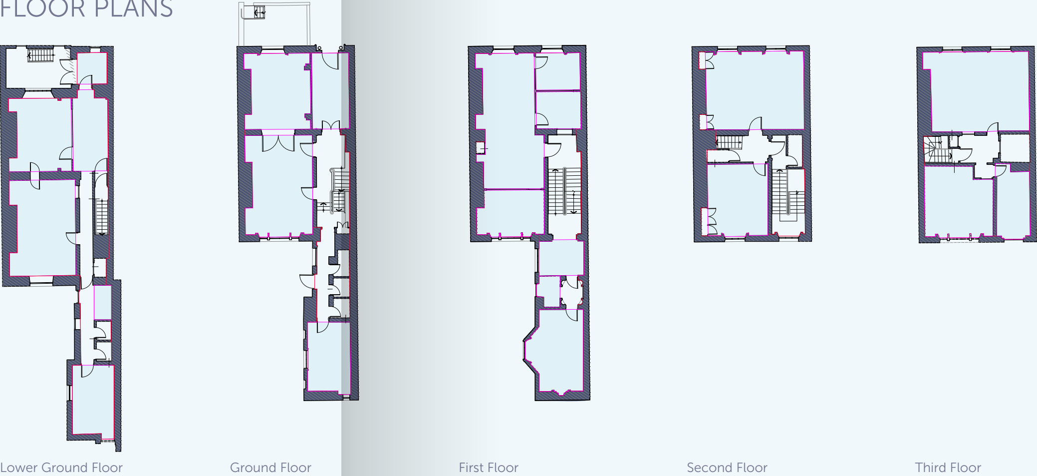
Floor plans are indicative and for illustrative purposes only.

There is potential for an investor to seek to continue operation as a serviced office or on standard leases. Alternatively, an owner occupier can seek to obtain vacant possession in the short term.