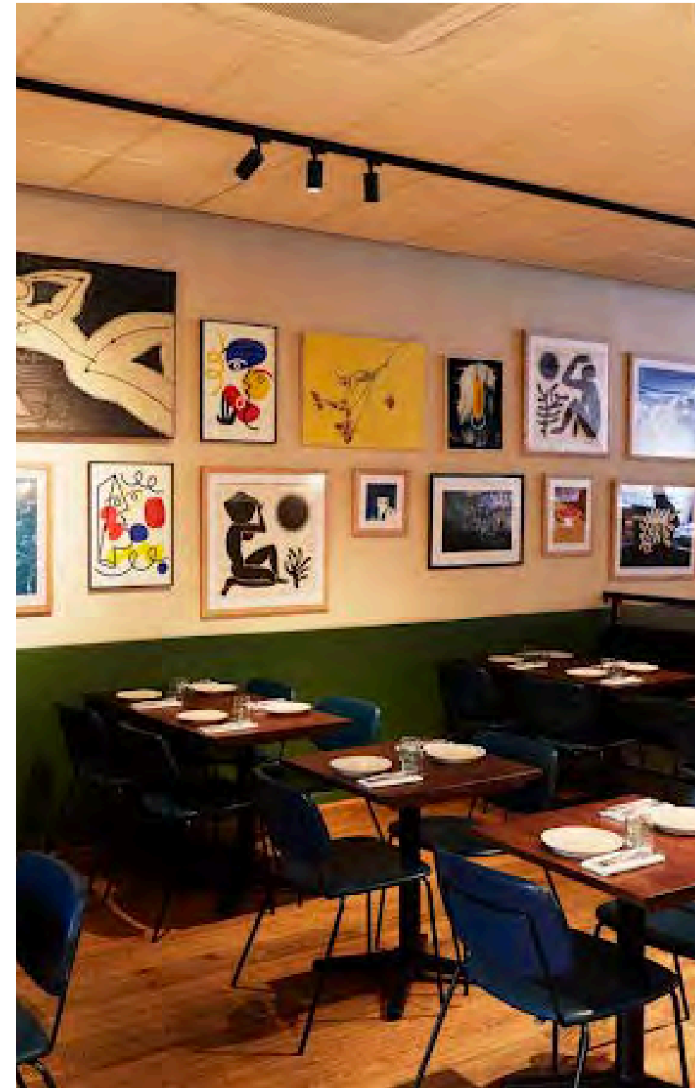
Honey & Smoke