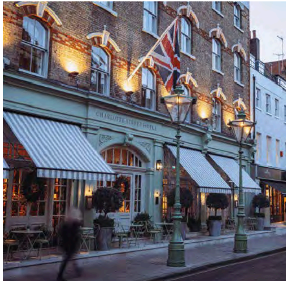
Charlotte Street Hotel