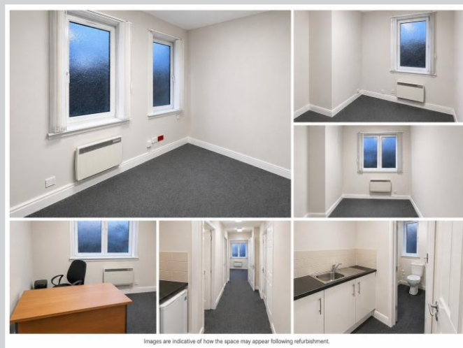
Images are indicative of how the space may appear following refurbishment.