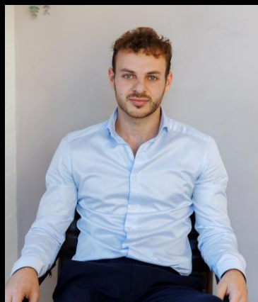
DANIEL JACKSON AGENCY dj@belcor.london 07725 203 254