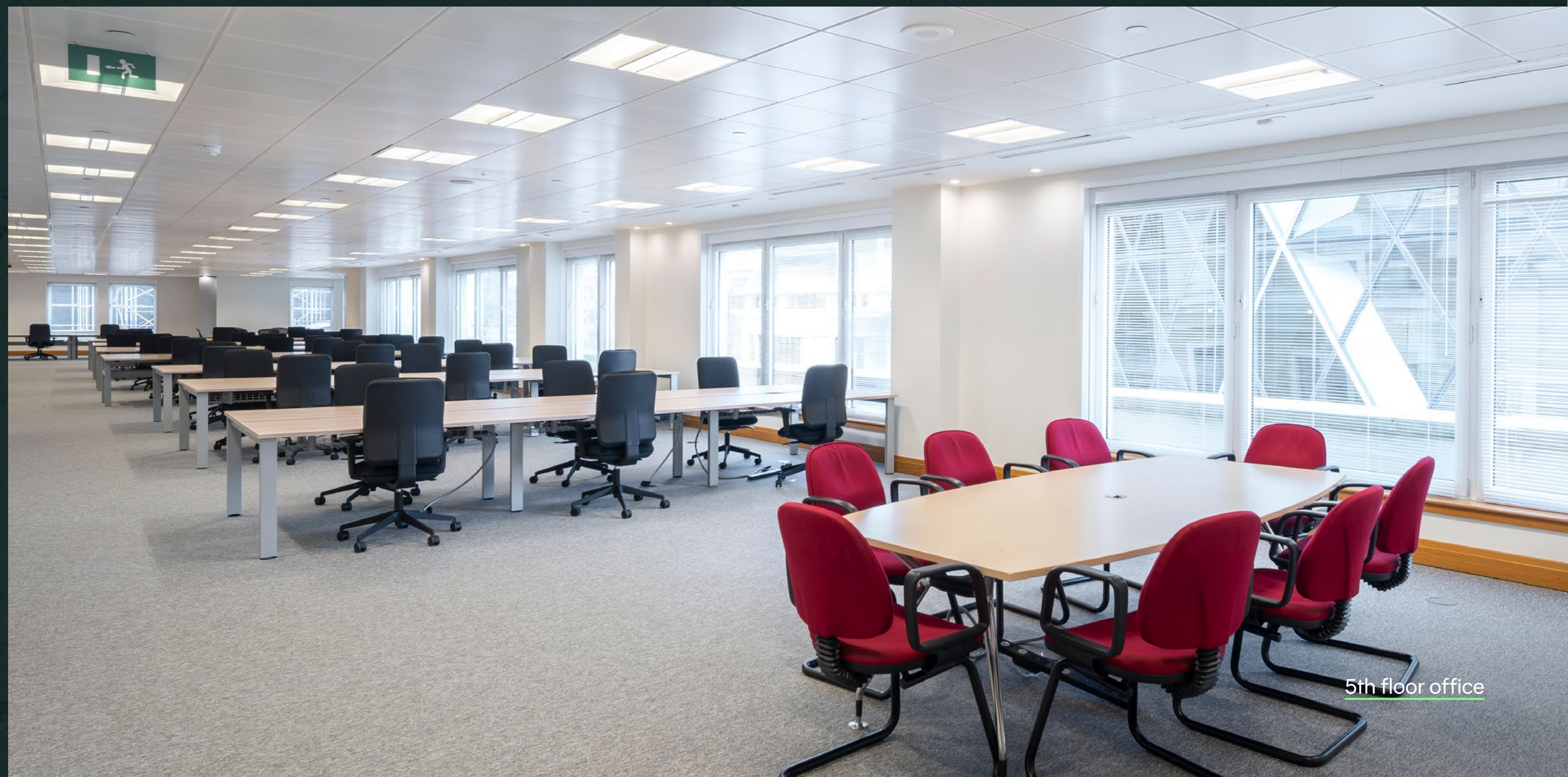
5th floor office