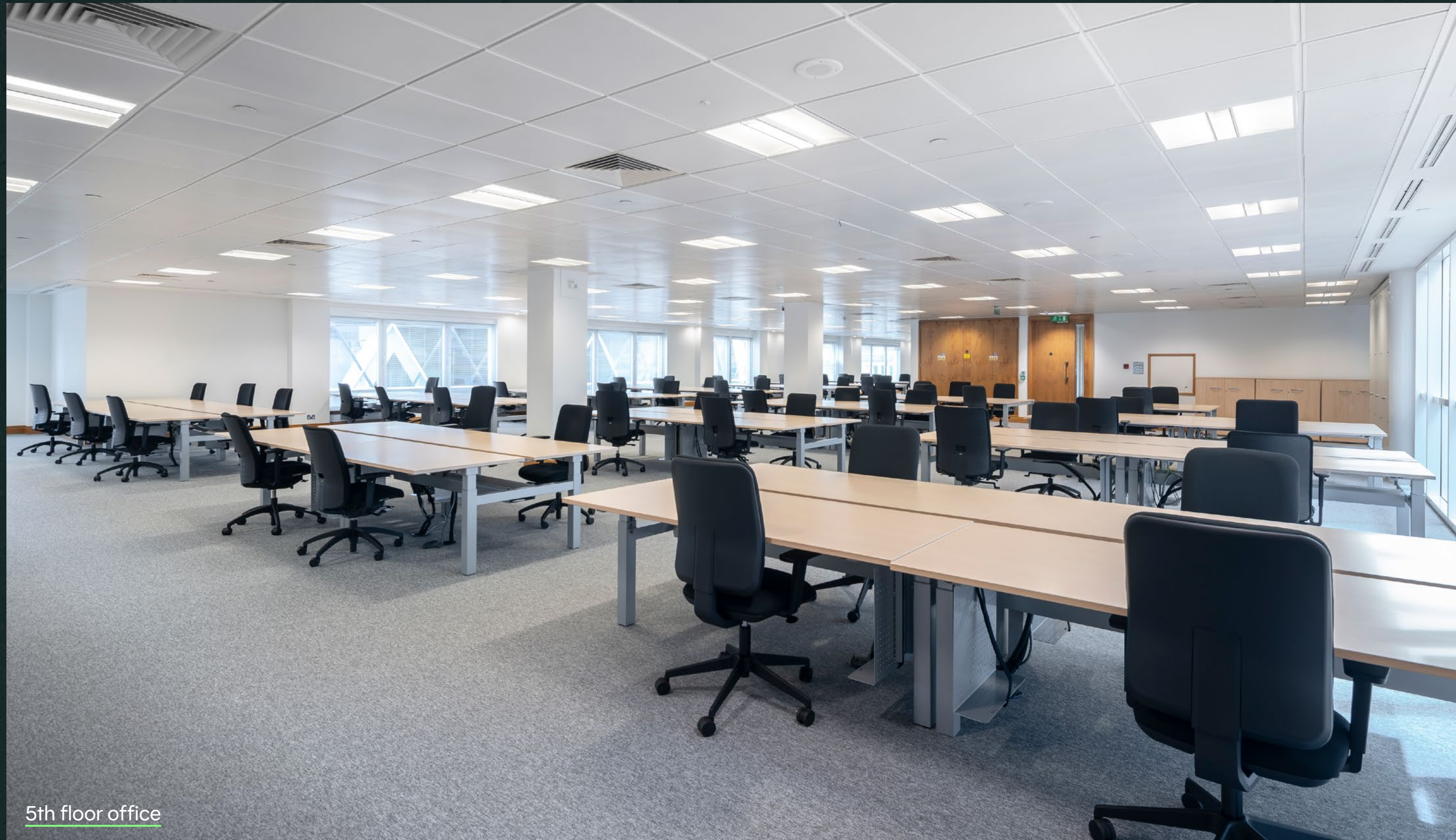
5th floor office