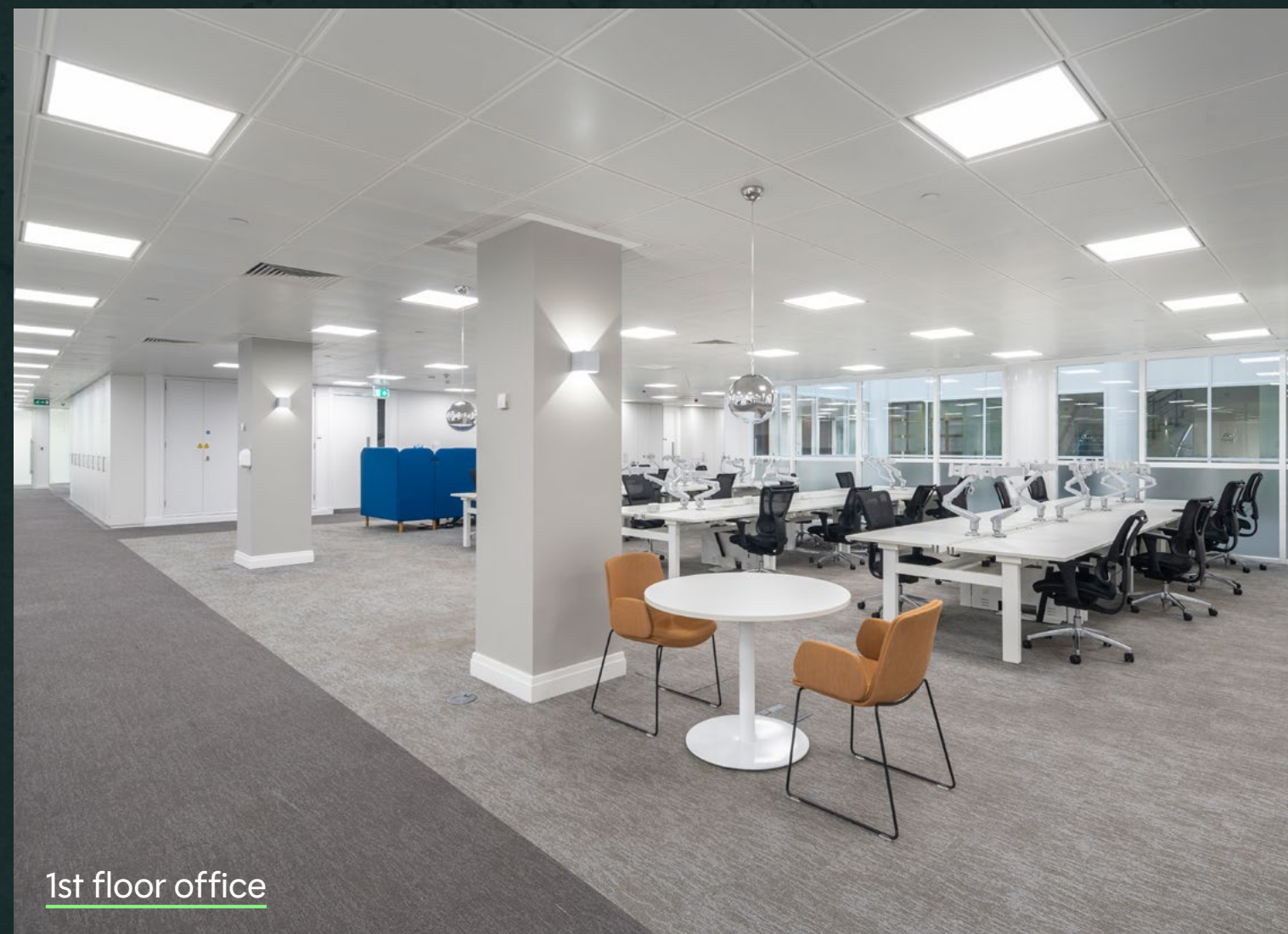
1st floor office