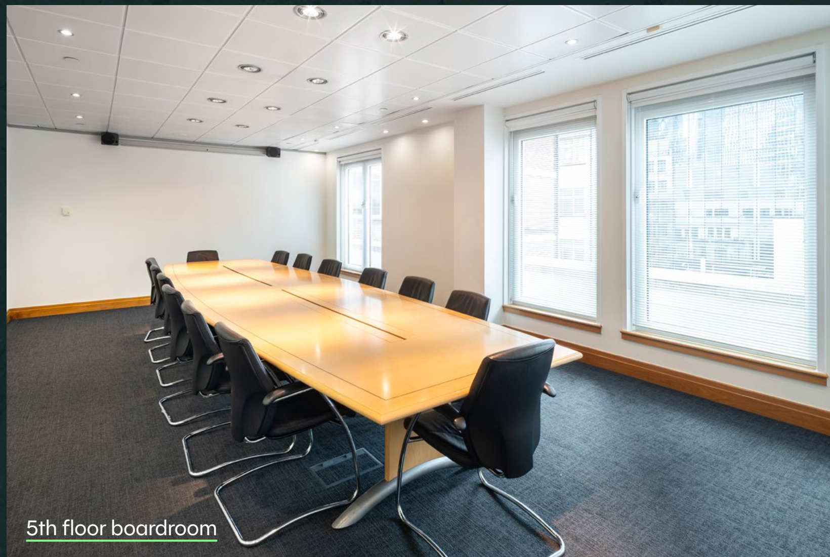
5th floor boardroom