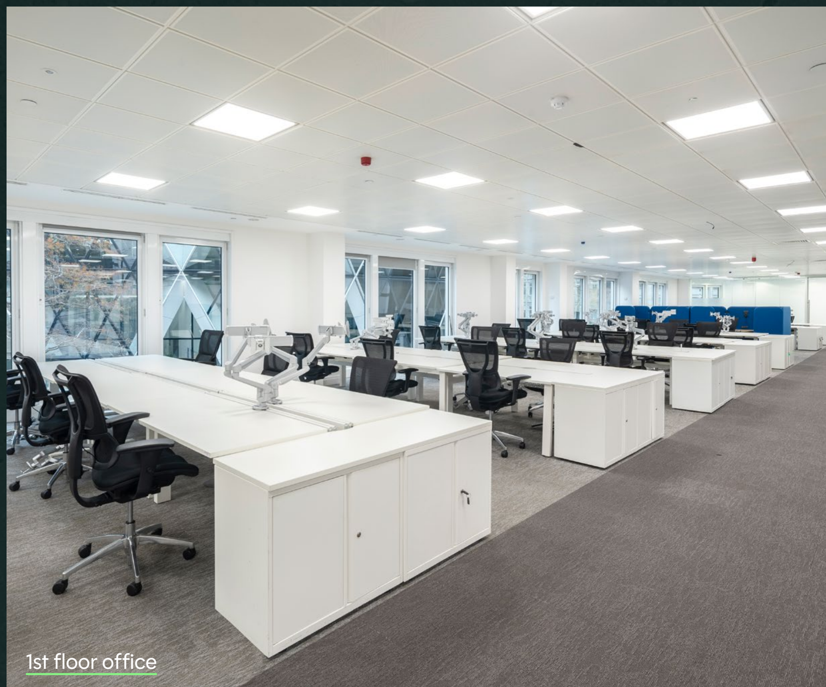
1st floor office

With ample workstations, agile areas and meeting rooms – Fitzwilliam House provides a dynamic office environment.