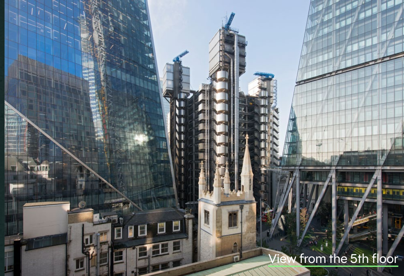
View from the 5th floor