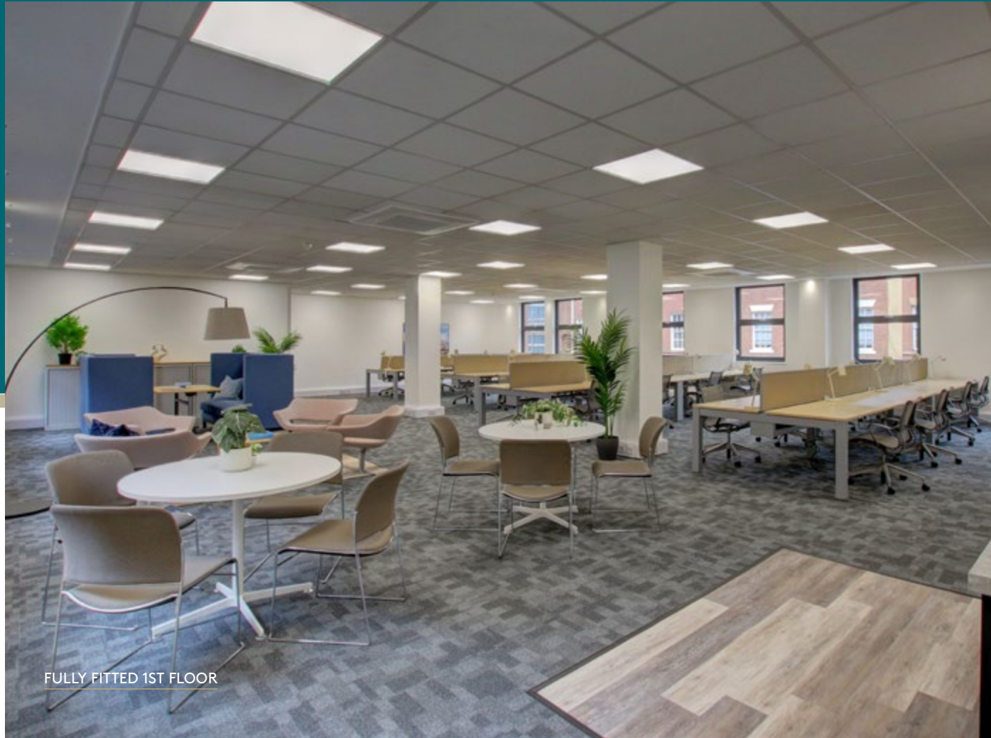
FULLY FITTED 1ST FLOOR