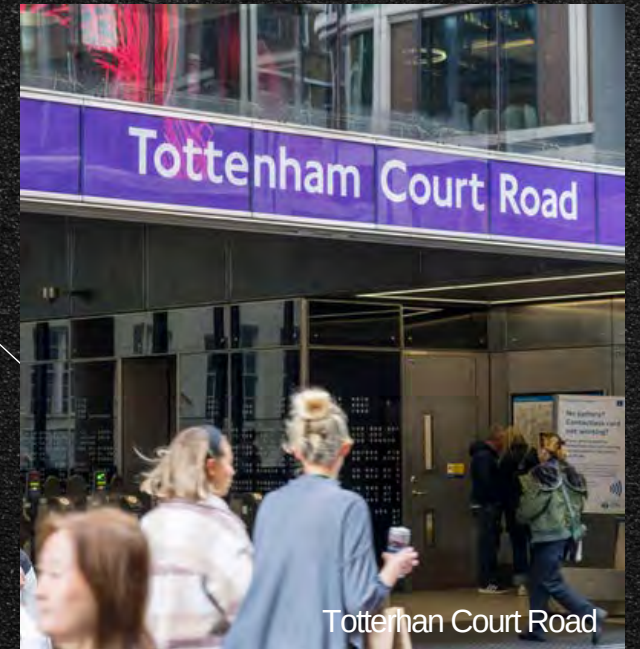
Tottenham Court Road