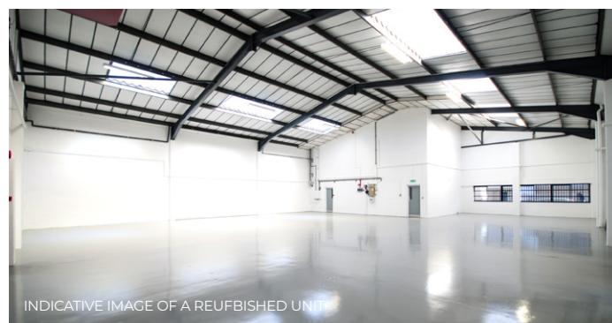
INDICATIVE IMAGE OF A REFURBISHED UNIT