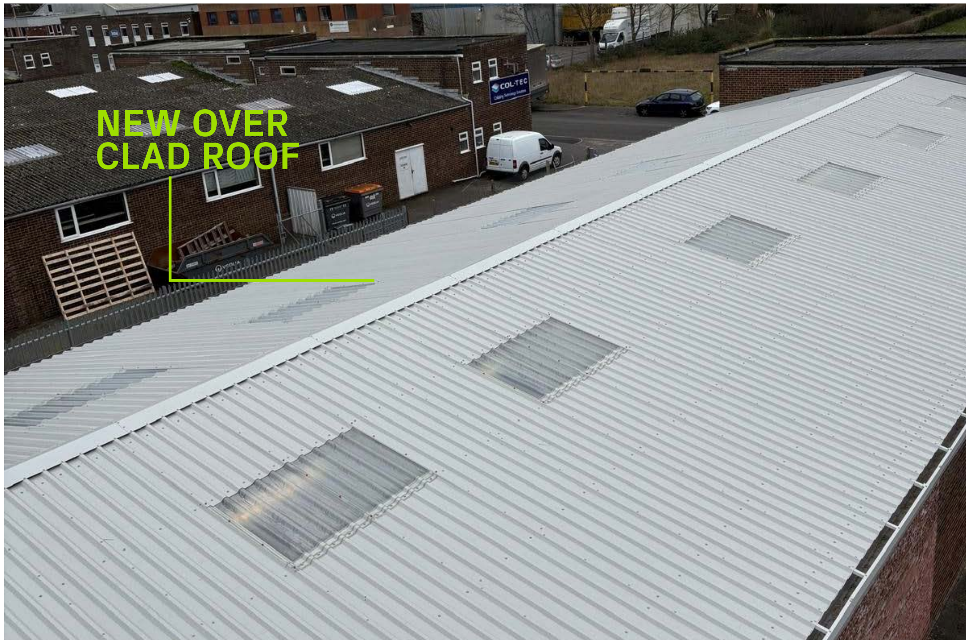
UNIT 2 QUEENSWAY , STEM LANE INDUSTRIAL ESTATE, NEW MILTON, HAMPSHIRE, BH25 5NN