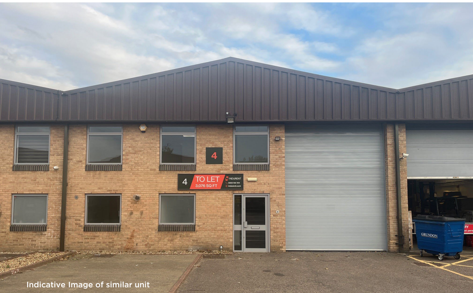
Indicative Image of similar unit