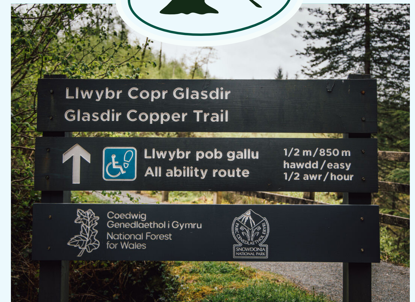
Coed y Brenin