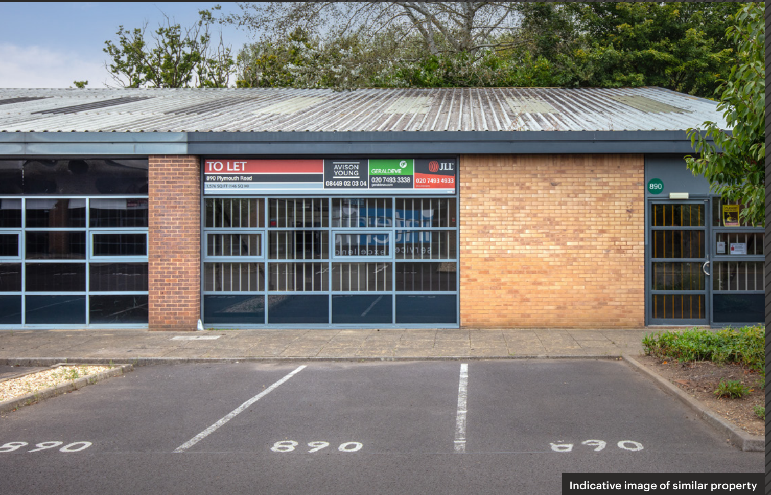
Indicative image of similar property

Available to let from Dec 2025 Single-storey Industrial / warehouse building 1,576 sq ft (146.4 sq m)