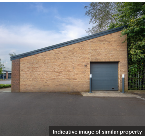
Indicative image of similar property