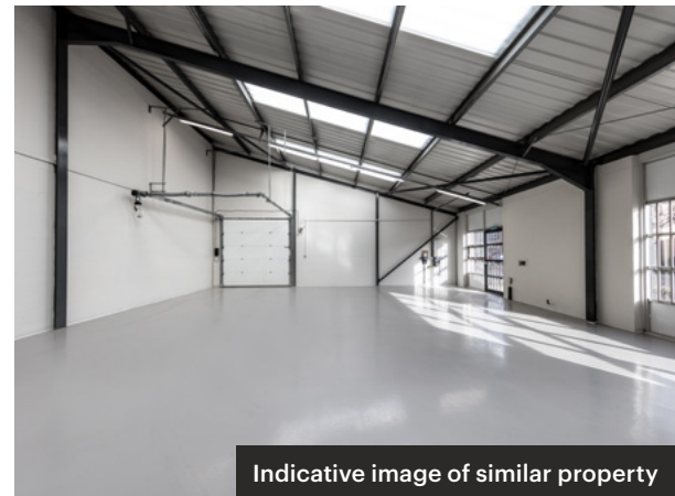
Indicative image of similar property