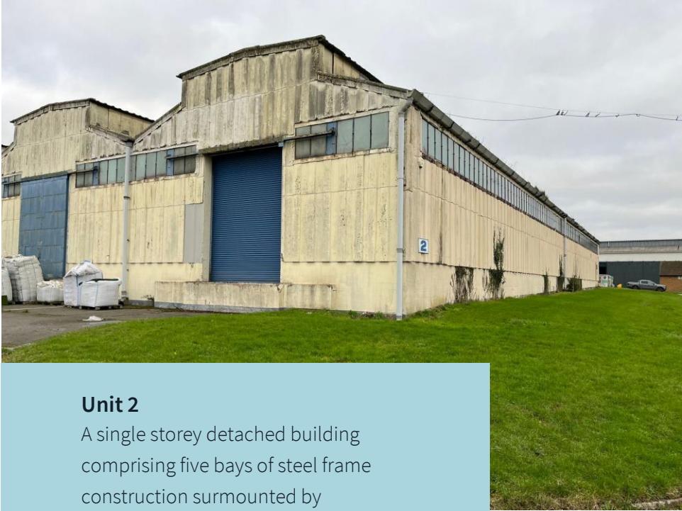
Unit 2 A single storey detached building comprising five bays of steel frame construction surmounted by pitched roofs, 5.4 metres to eaves, concrete floor, lighting and five level access and five docked doors.