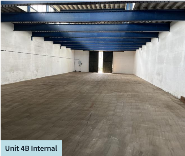
Unit 4B Internal