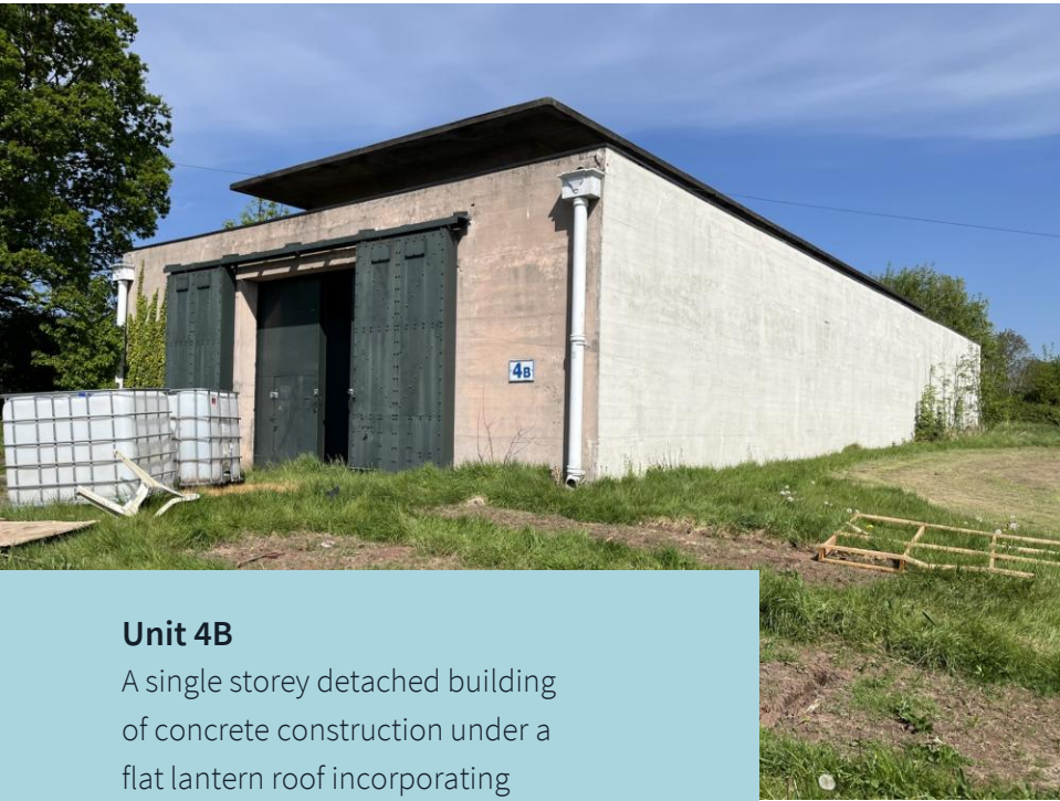
Unit 4B A single storey detached building of concrete construction under a flat lantern roof incorporating natural lighting. Access to the building is via a sliding door.

Cursley Distribution Park comprises a warehouse complex of 245,000 sq ft on 24 acres and consists of 4 main detached warehouse buildings and a range of ancillary stores and offices.