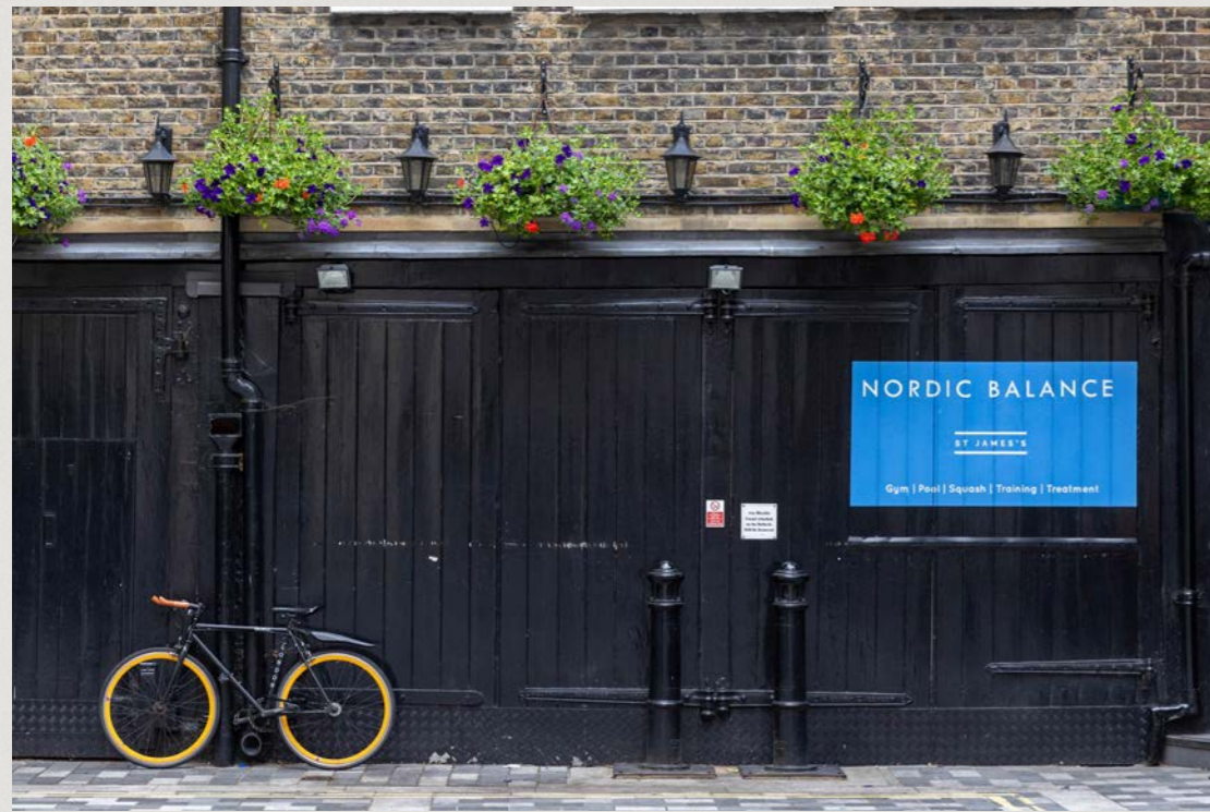
← Nordic Balance ↓ St. James's Sq.

Discover St. James's; historically prestigious yet refreshingly contemporary, this iconic neighbourhood thrives today through acclaimed galleries, refined restaurants, and unique shops.