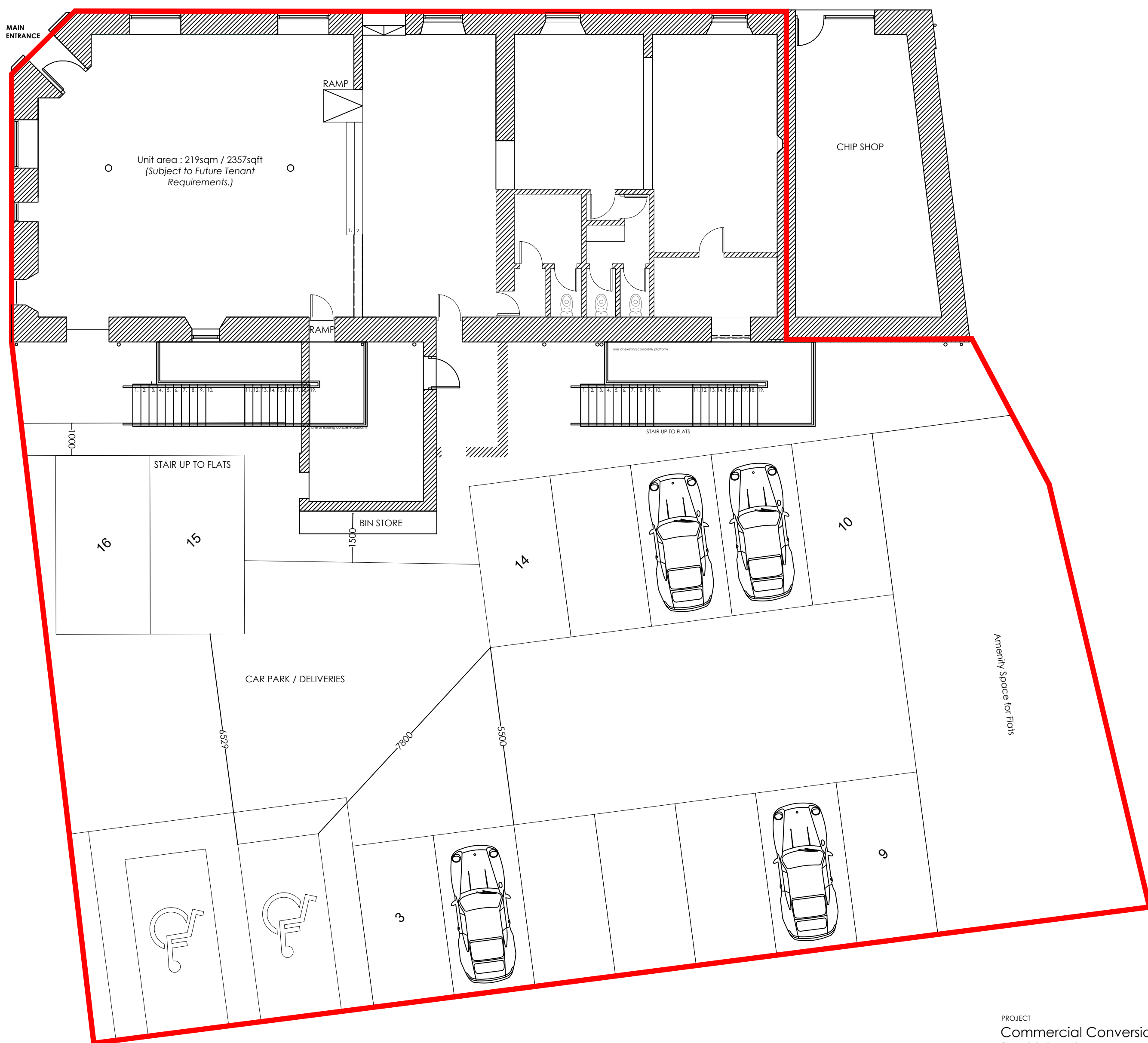
FLOOR PLAN (as proposed) 1:100 @ A1

PROJECT Commercial Conversion for Lisini Retirement Benefits Scheme at West End Bar, Glasgow Road, Blantyre, G72 9 Glasgow