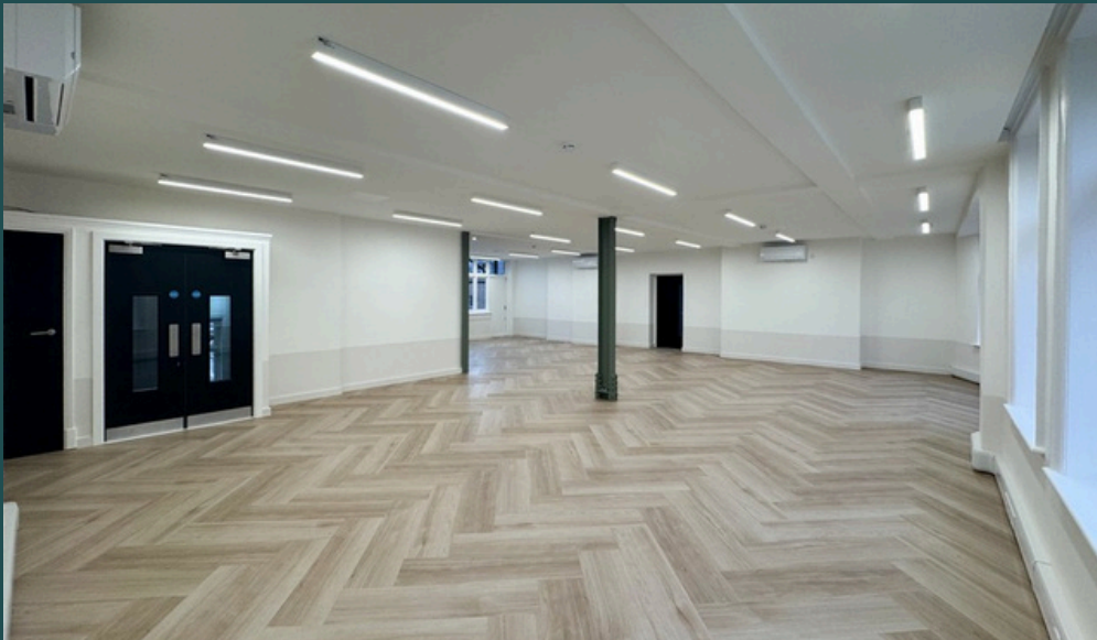
36-38 Mortimer Street, 3 rd Floor