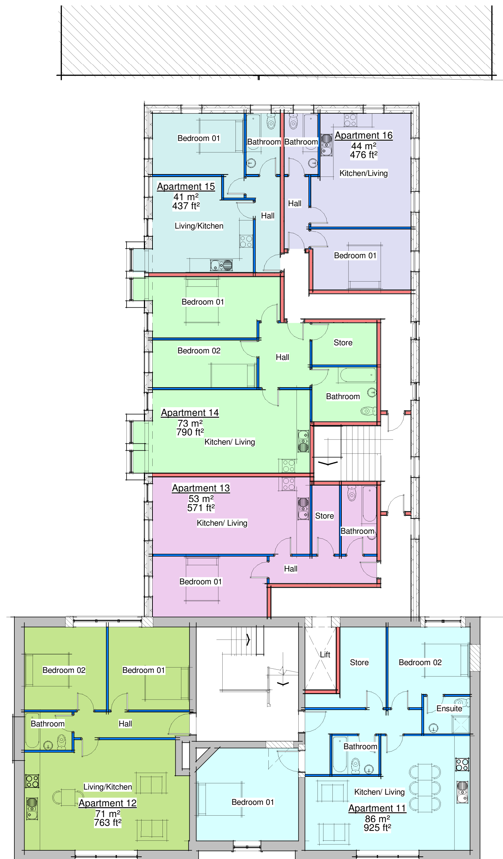
02_Proposed Second Floor 1 : 100