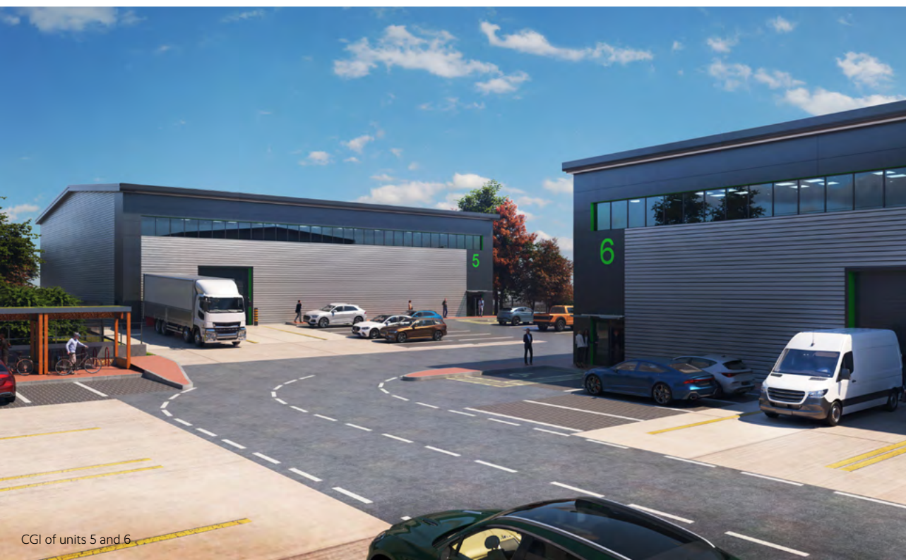
CGI of units 5 and 6