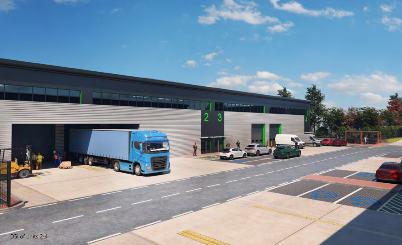
CGI of units 2-4