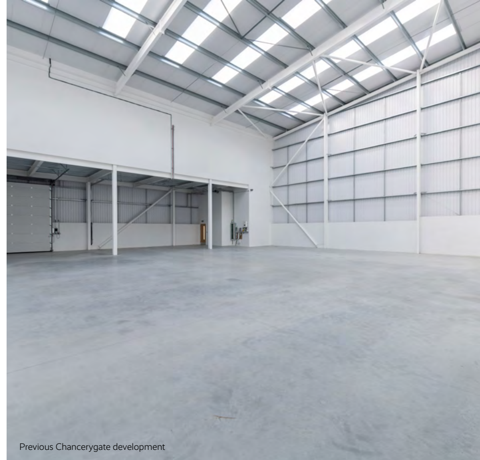
Previous Chancerygate development