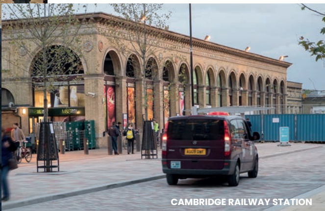
CAMBRIDGE RAILWAY STATION