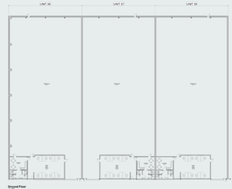
Units available to split