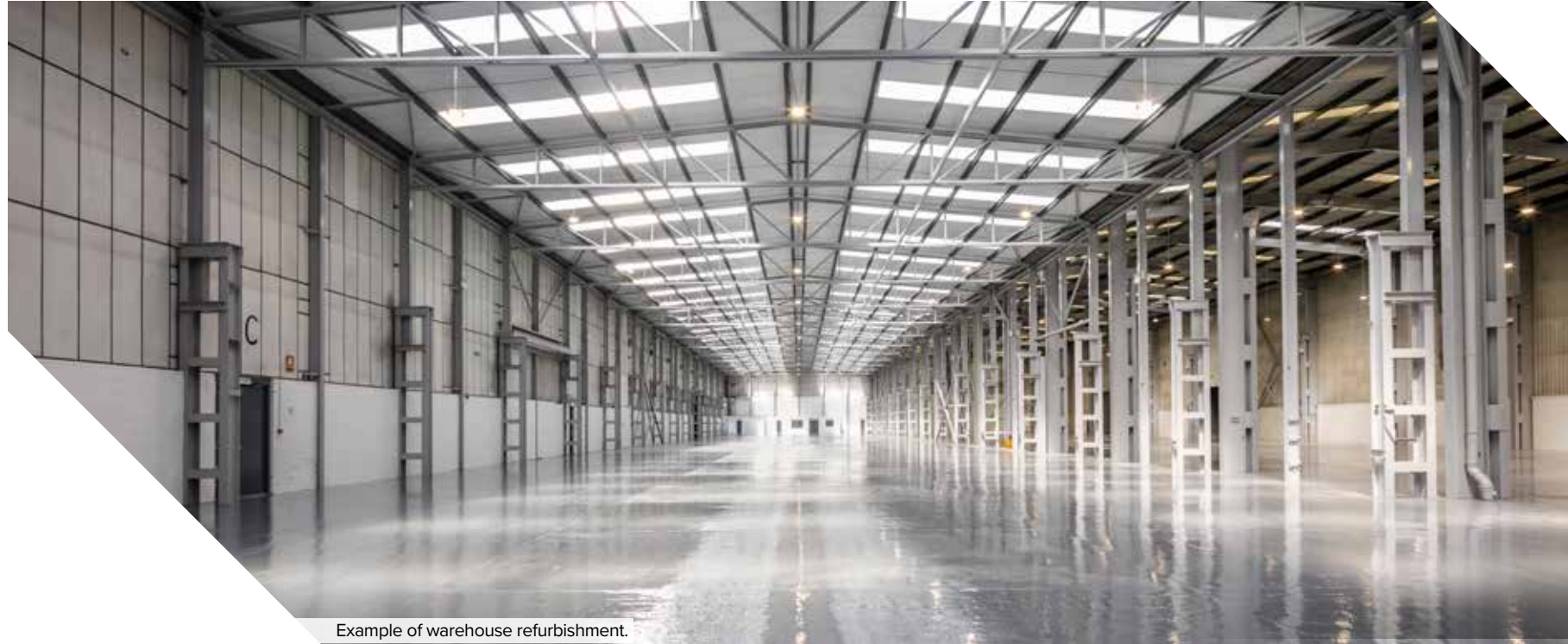
Example of warehouse refurbishment.