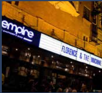
Shepherd's Bush Eimpire