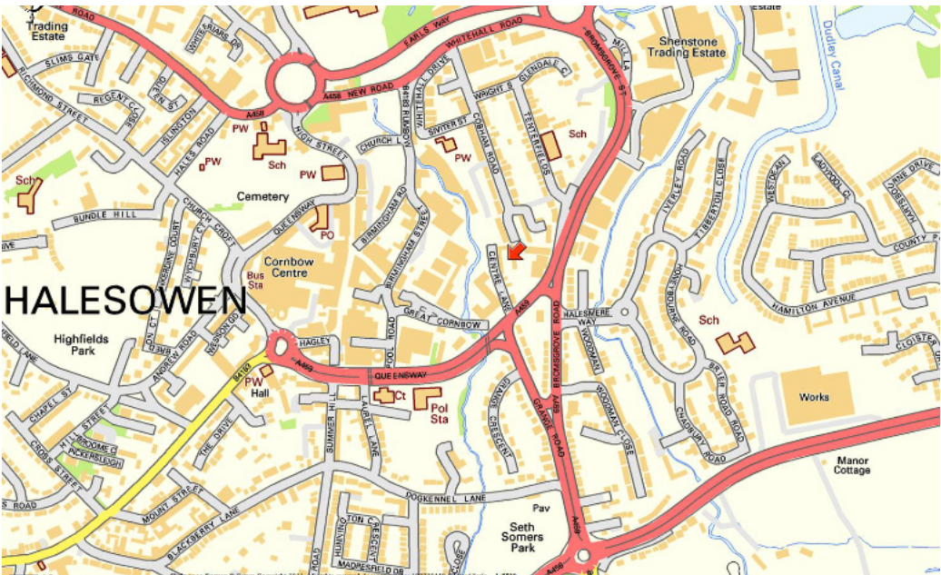
Licence Number - 100022432 - Not to Scale

Strictly by prior arrangement with the agent.