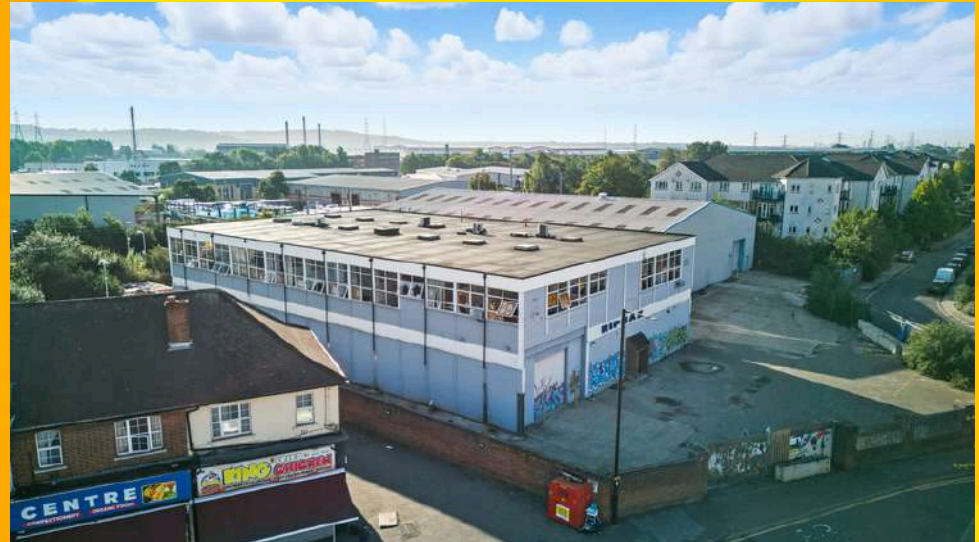
Existing mixed use unit in foreground