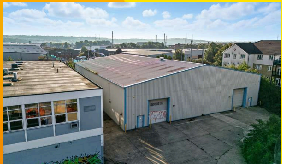
Existing single storey warehouse