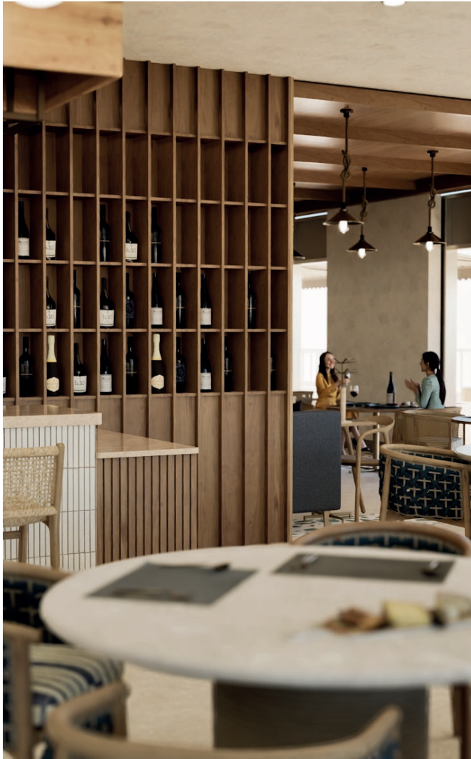
CGI for illustrative purposes