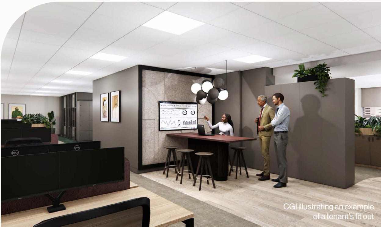
CGI illustrating an example of a tenant's fit out