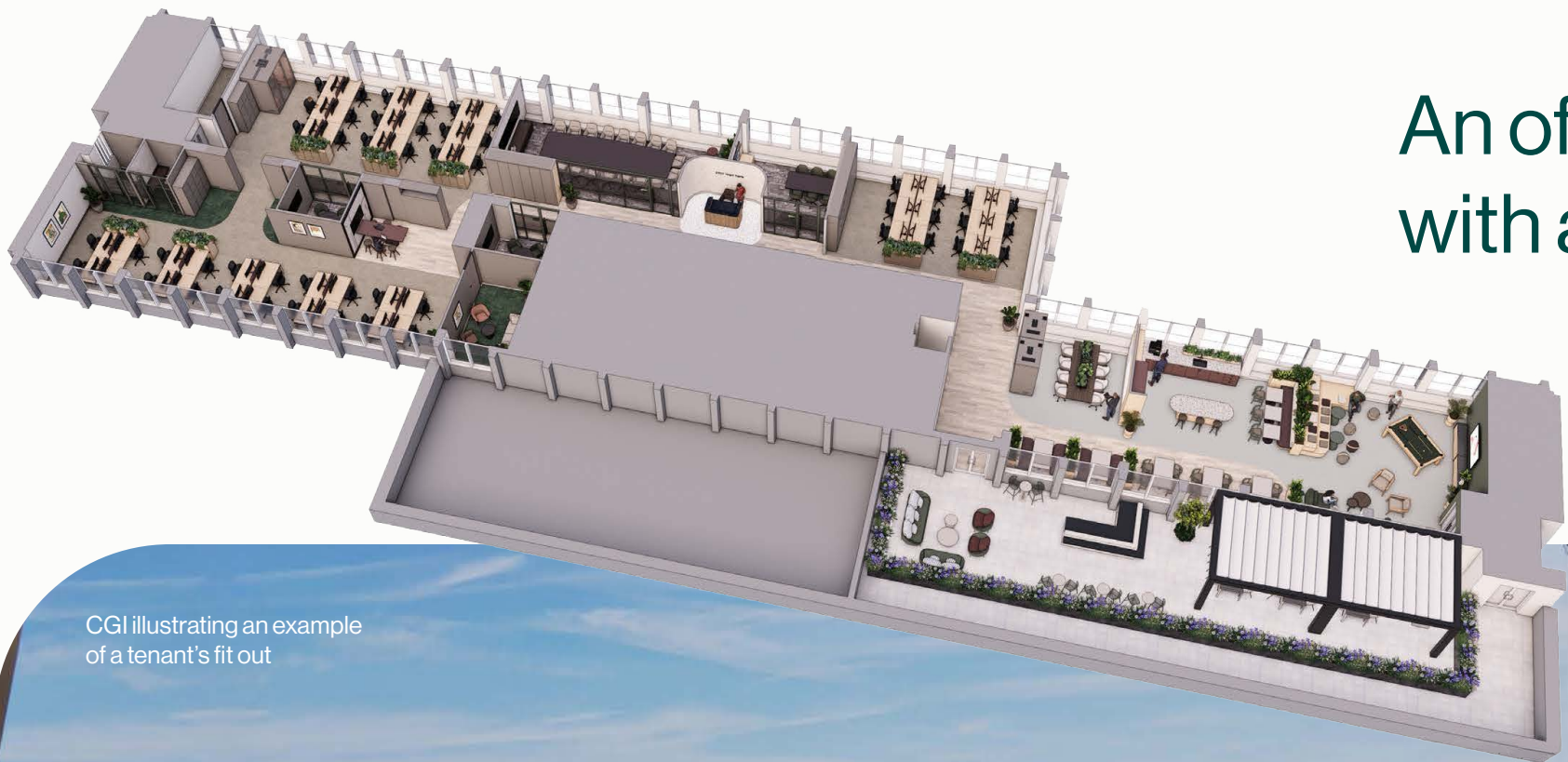
CGI illustrating an example of a tenant's fit out