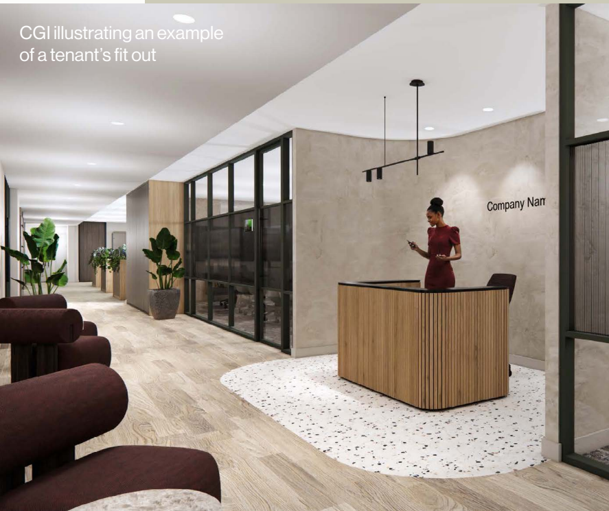
CGI illustrating an example of a tenant's fit out