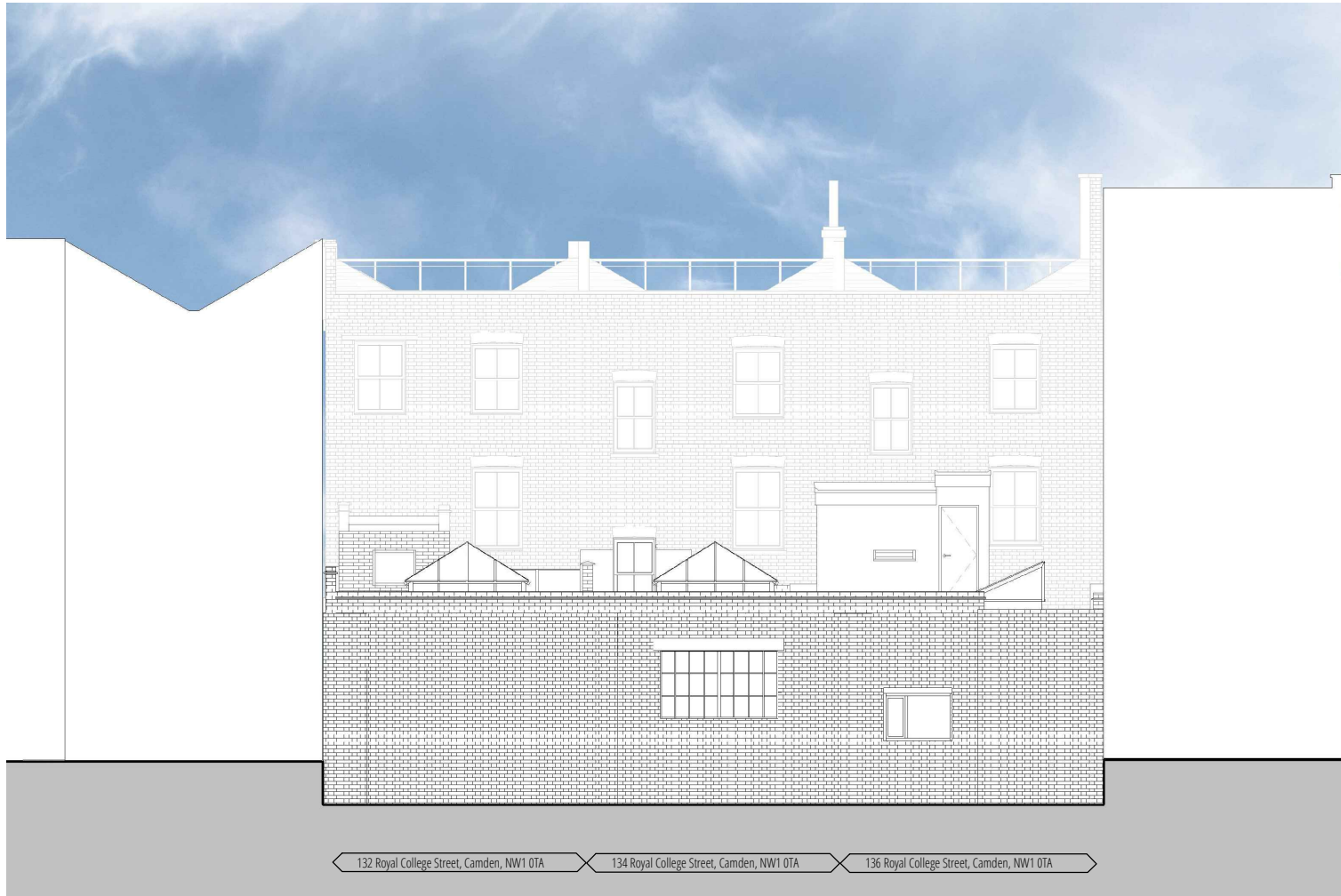
1 Existing Rear Elevation 1 : 100

NOTES: 1. THIS DRAWING IS COPYRIGHT AND MUST NOT BE REPRODUCED IN WHOLE OR IN PART WITHOUT WRITTEN PERMISSION OF GAA DESIGN. 2. THIS DRAWING REPRESENTS DESIGN INTENT AND CONCEPT ONLY. IT IS NOT TO BE USED FOR PLANNING PURPOSES ONLY. 3. THIS DOCUMENT AND ALL ASSOCIATED DOCUMENTS ARE PREPARED FOR SPECIFIC SITE AND SCHEME AND INCORPORATE CALCULATIONS AND MEASUREMENTS AVAILABLE FROM THE CLIENT AT THE TIME OF DRAWING. 4. THE RECEIPTER AGREES TO PROTECT THE CONTENTS FROM DISSEMINATION AND DISSEMINATION EXCEPT AS REQUIRED FOR THE SPECIFIC CLIENT NAMED, WITHOUT THE WRITTEN PERMISSION OF THE DESIGNER. 5. USE OF THIS DESIGN IS GRANTED TO THE CLIENT FOR THE SPECIFIC AND NAMED EVENT ONLY. COPYRIGHT © 2019